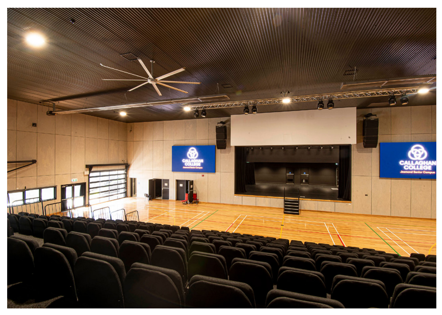
Callaghan College Jesmond Campus upgrade