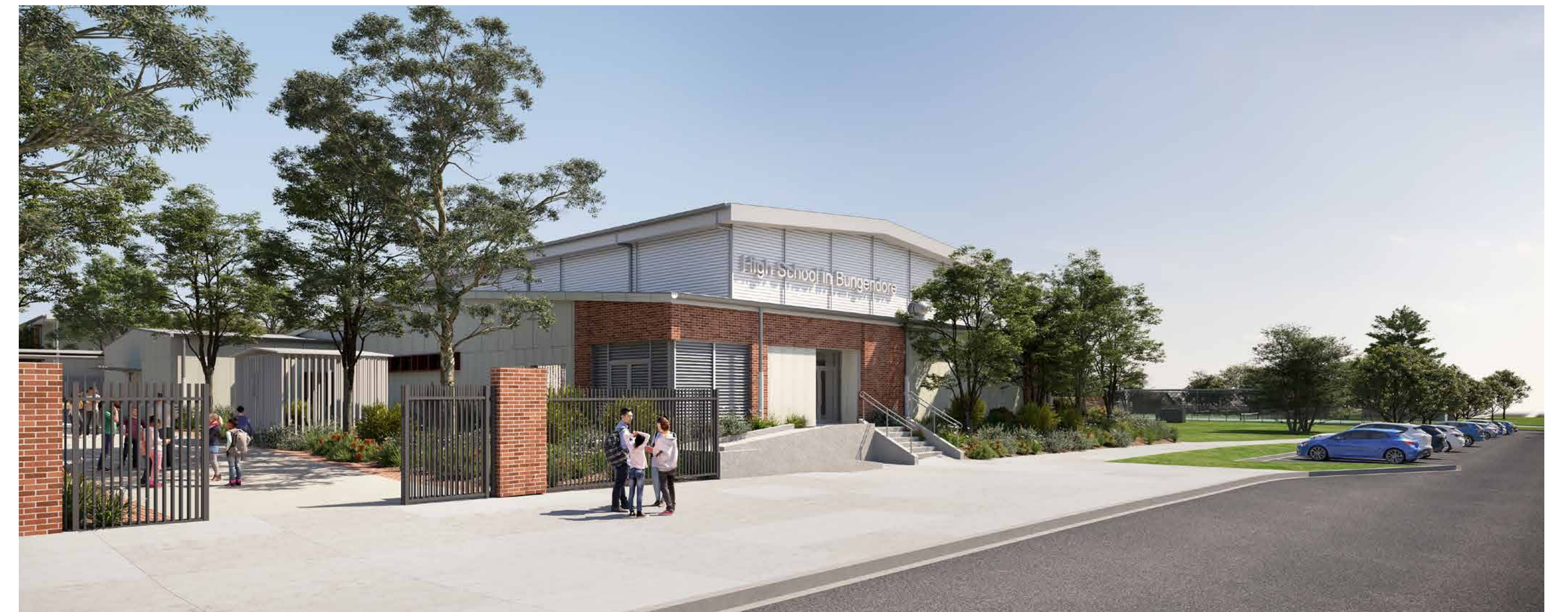
The Kiss and Drop and pedestrian entry on Turallo Terrace.