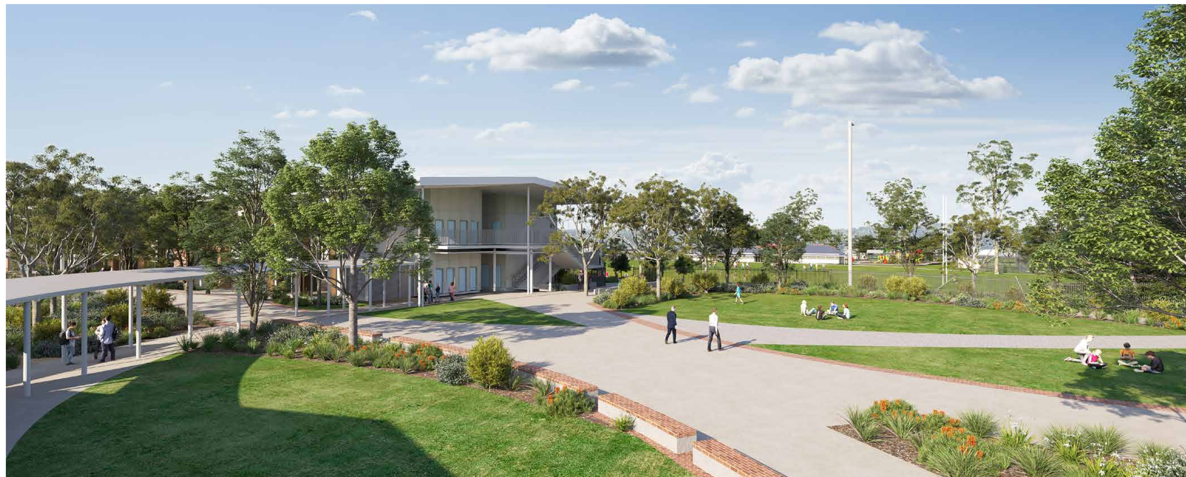
Artist impression of the high school common looking toward Mick Sherd Oval.