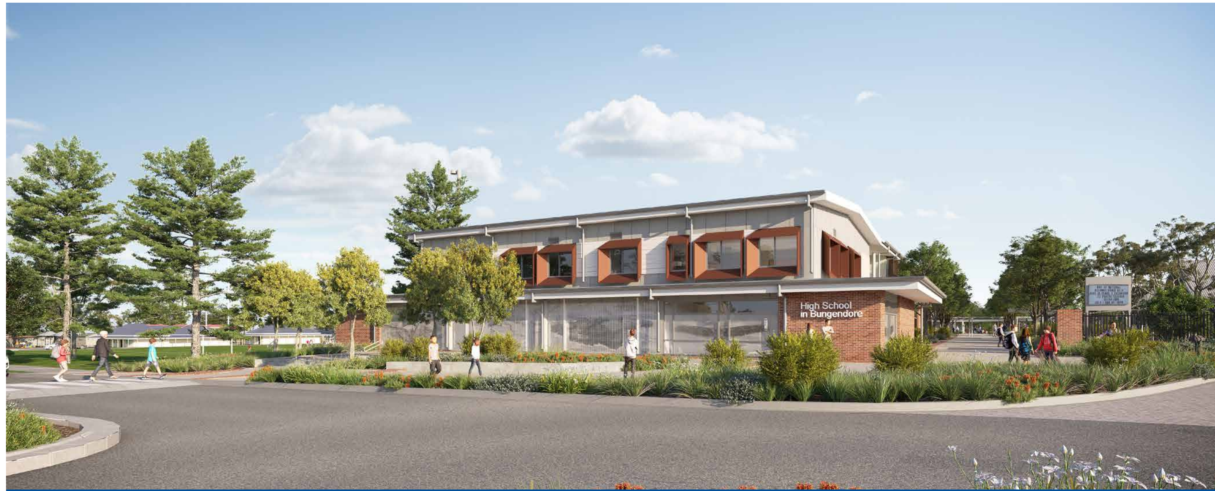
The new high school will be located in the Majara/Gibraltar Streets precinct with a connection to Bungendore Public School by a Wombat crossing on Gibraltar Street.

Artist impressions of Bungendore High School. All artist impressions are indicative only.