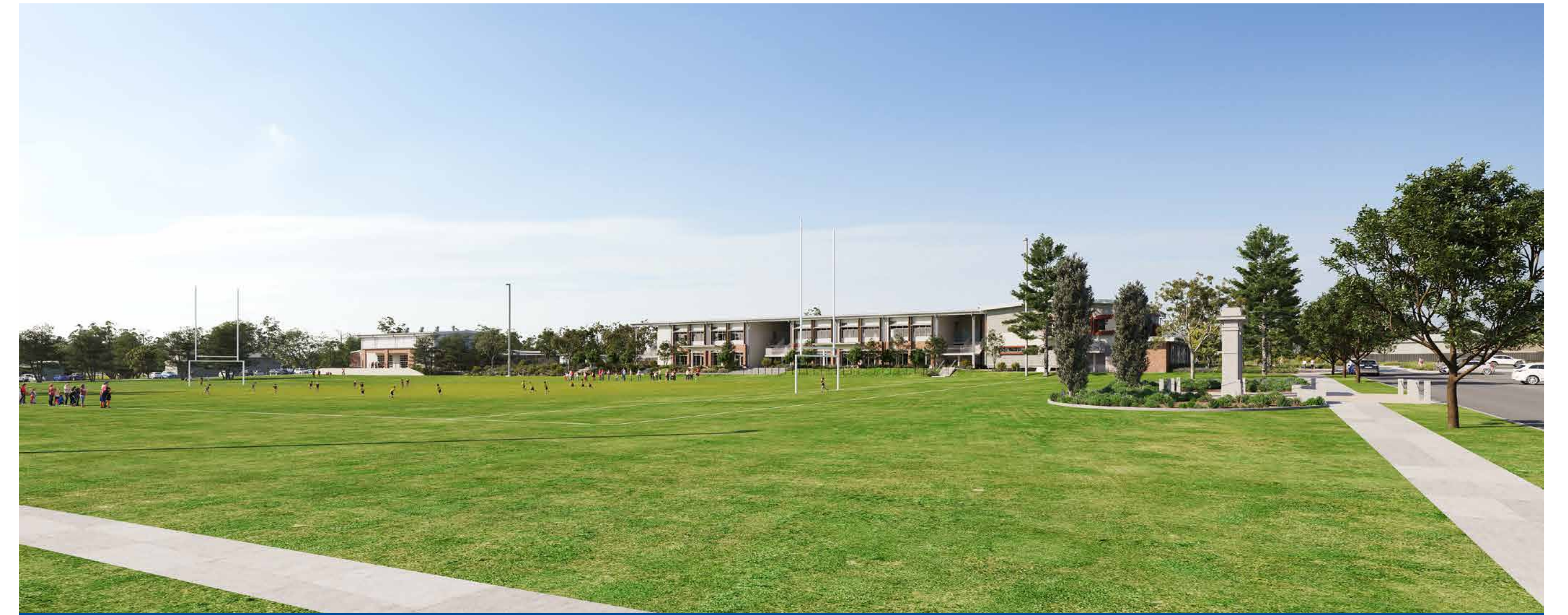
Looking across Mick Sherd Oval to the high school. The Bungendore and District War Memorial is on the right.