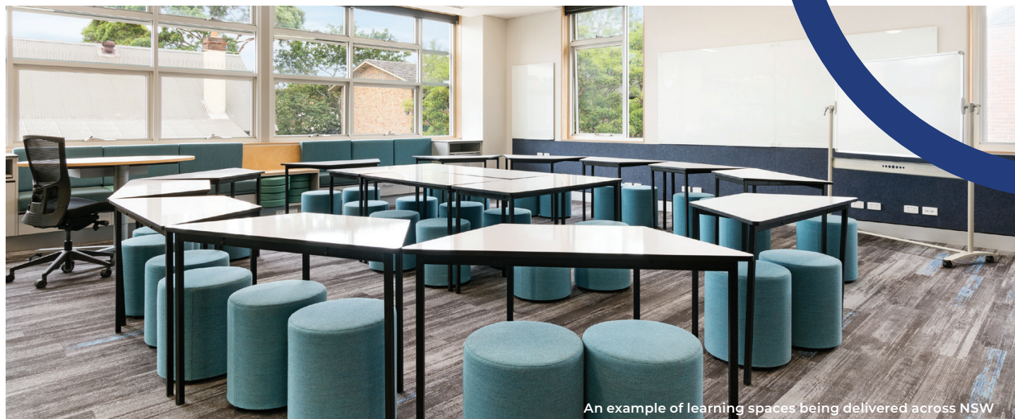
An example of learning spaces being delivered across NSW