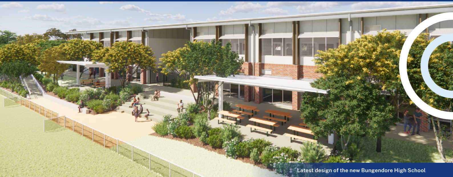
Latest design of the new Bungendore High School