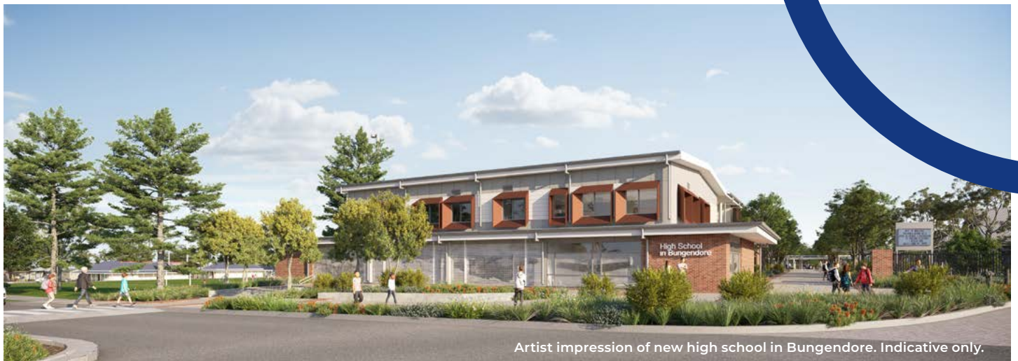
Artist impression of new high school in Bungendore. Indicative only.