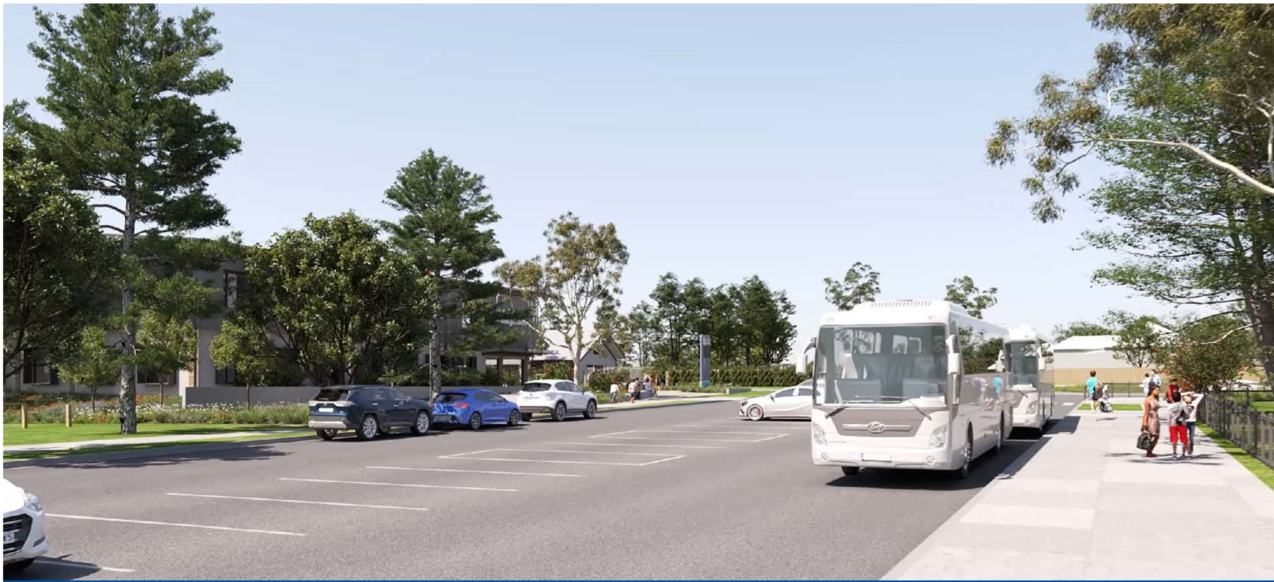
Looking across Gibraltar Street from the Public School to the proposed new high school.