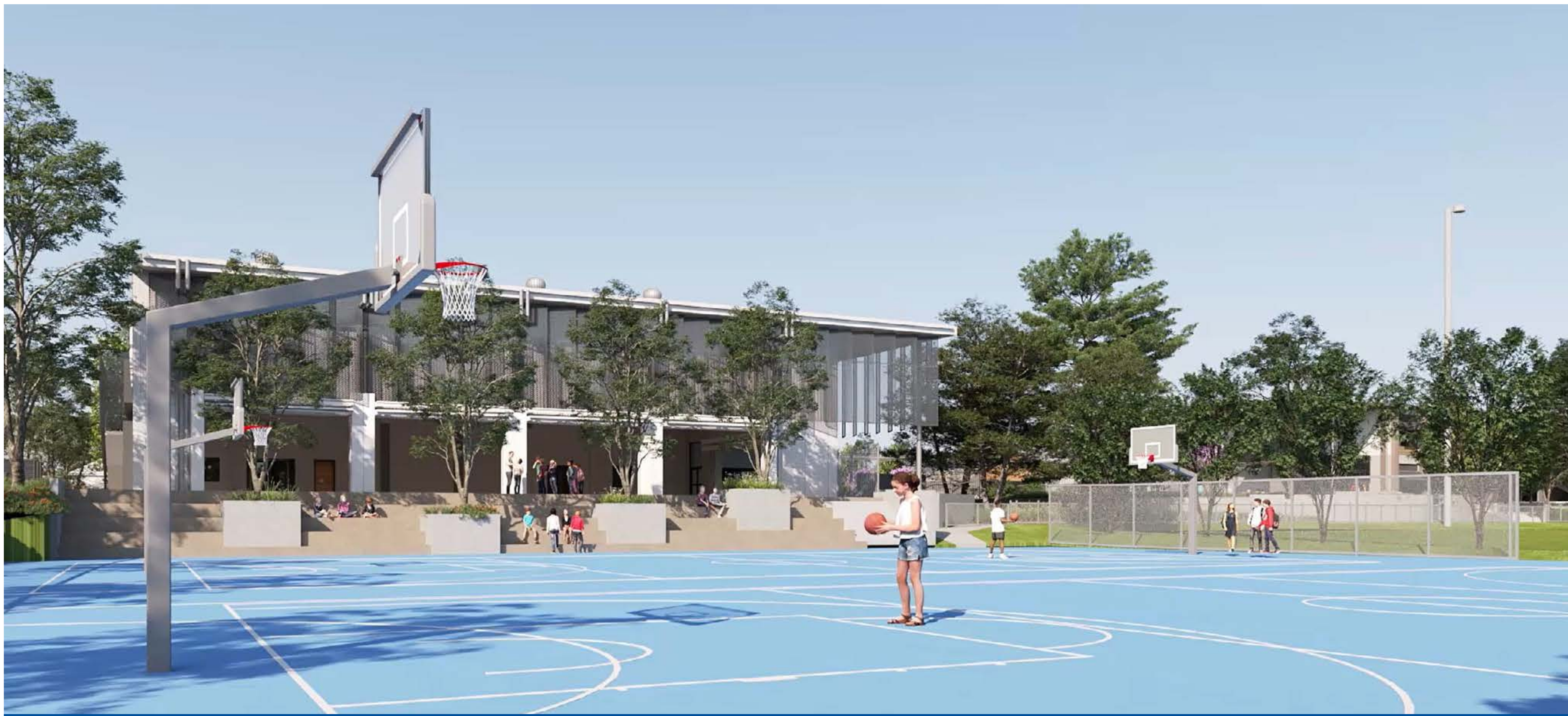
View across the proposed new high school's sports courts.