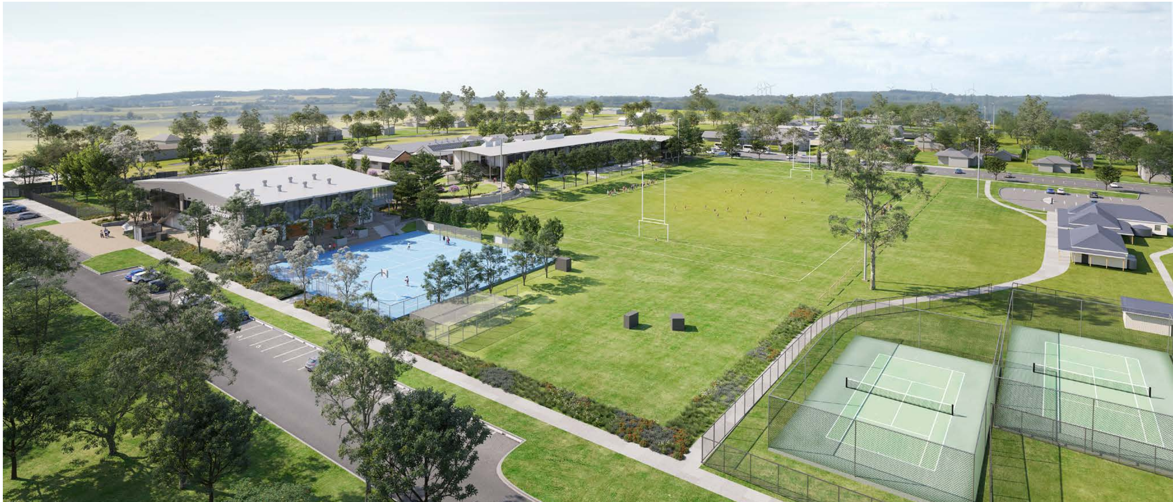
Looking across Mick Sherd Oval to the high school, with the new high school sports courts on the left.