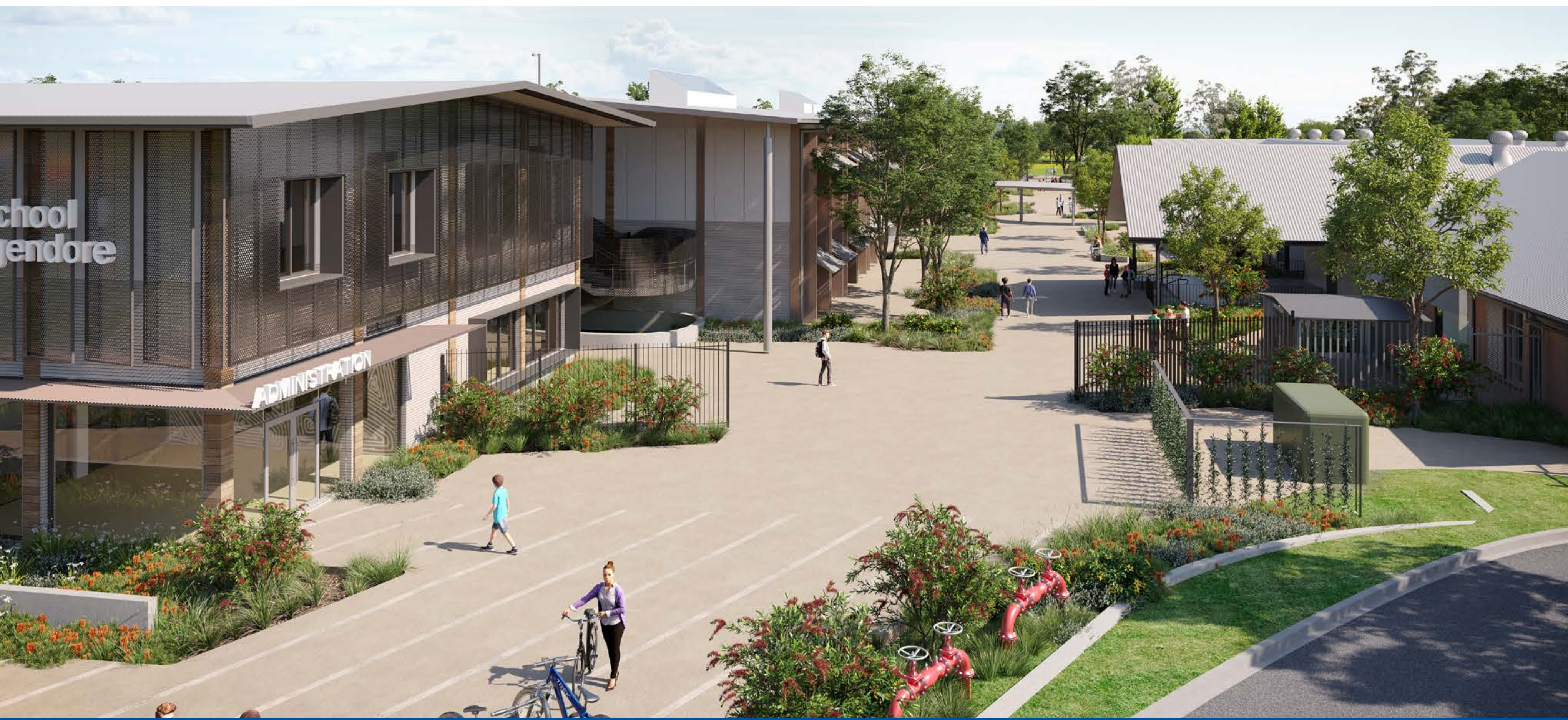
Artist impression of the proposed school plaza with refurbished former Queanbeyan-Palerang Regional Council buildings on the right.