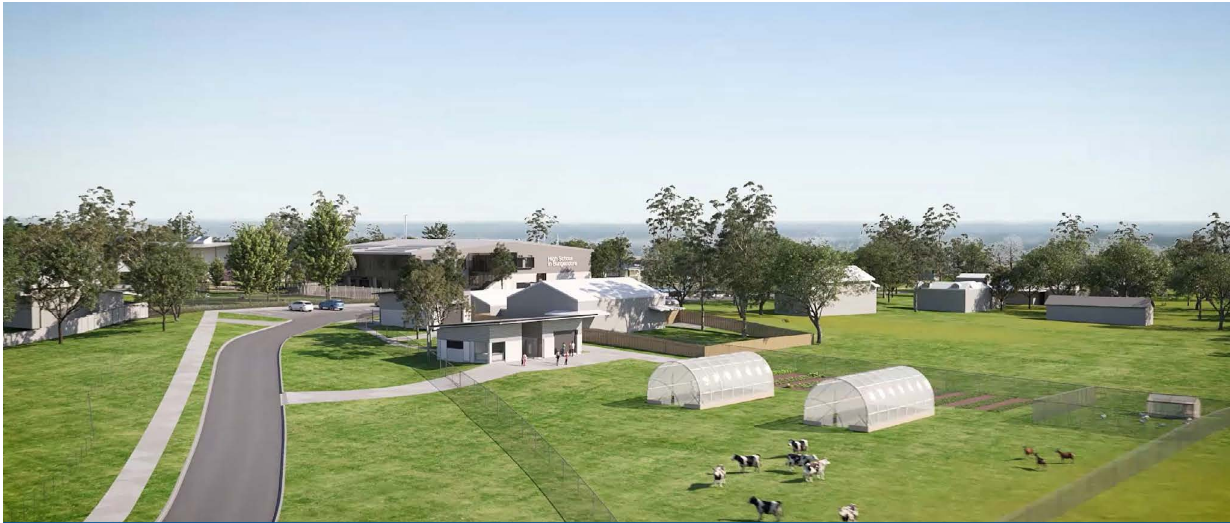
Looking across the proposed agricultural plot (off Turallo Terrace, adjacent to the existing 1st Bungendore Scout hall).

Artist impressions of the new high school in Bungendore. All artist impressions are indicative only and subject to change.