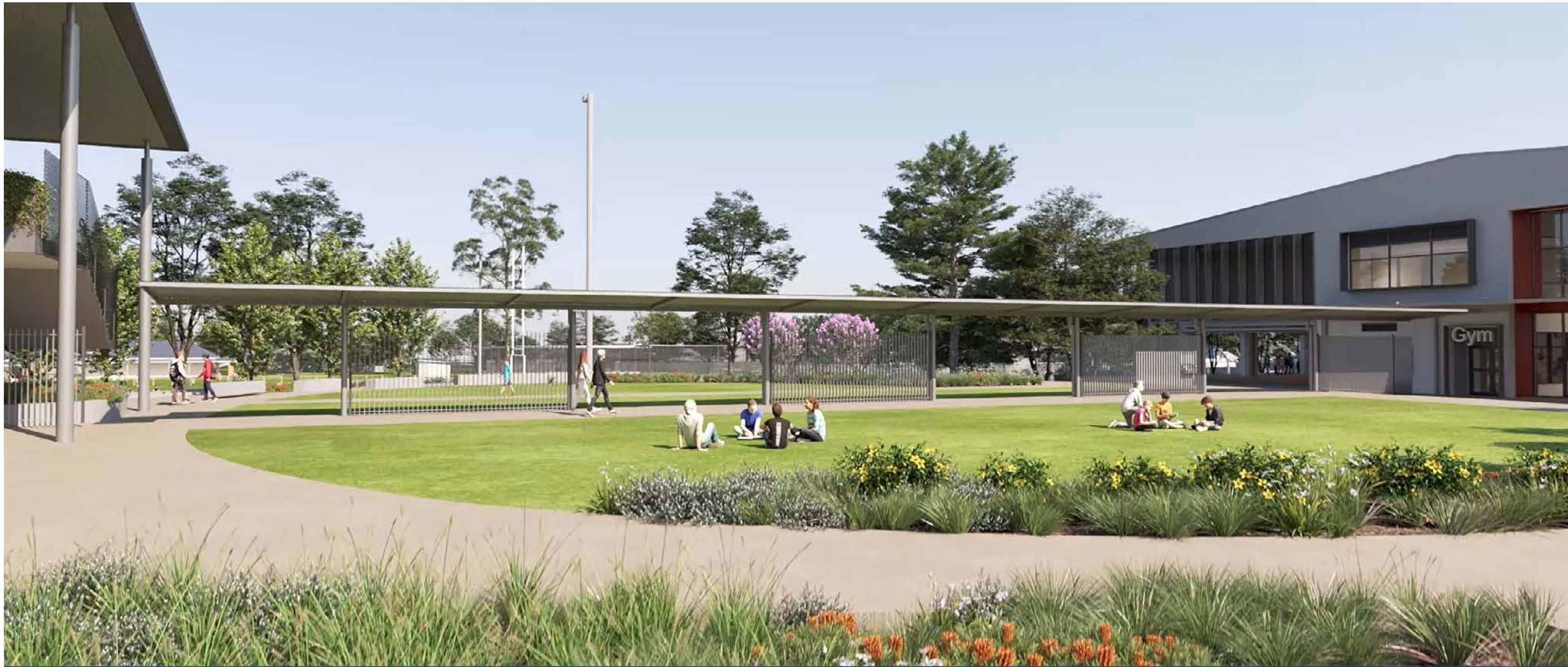
Artist impression of the proposed school quadrangle, looking toward Mick Sherd Oval.