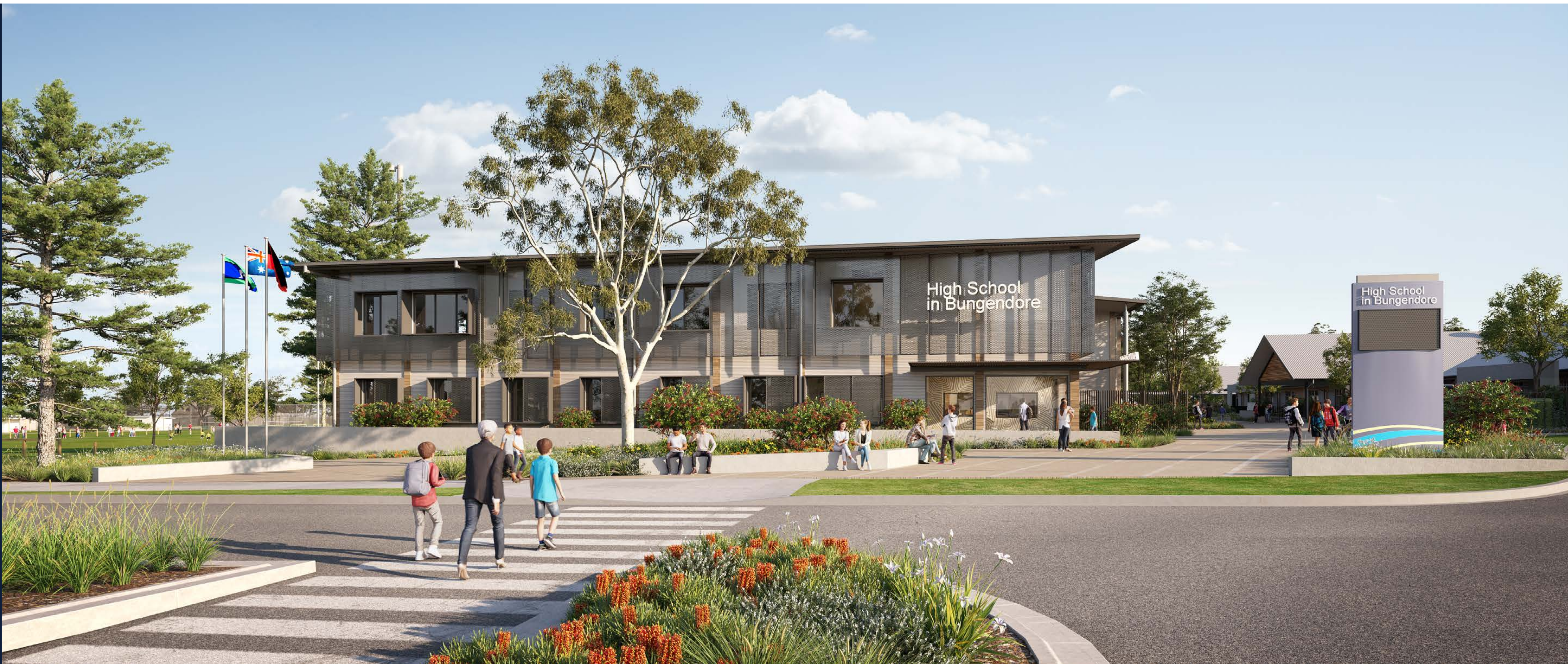
Artist impression of the new high school in Bungendore. Indicative only and subject to change.

Bungendore Public School will also receive upgrades including to the existing playing field, a new amenities block and new field lighting. Additional teaching spaces are also to be created at Bungendore Public School.