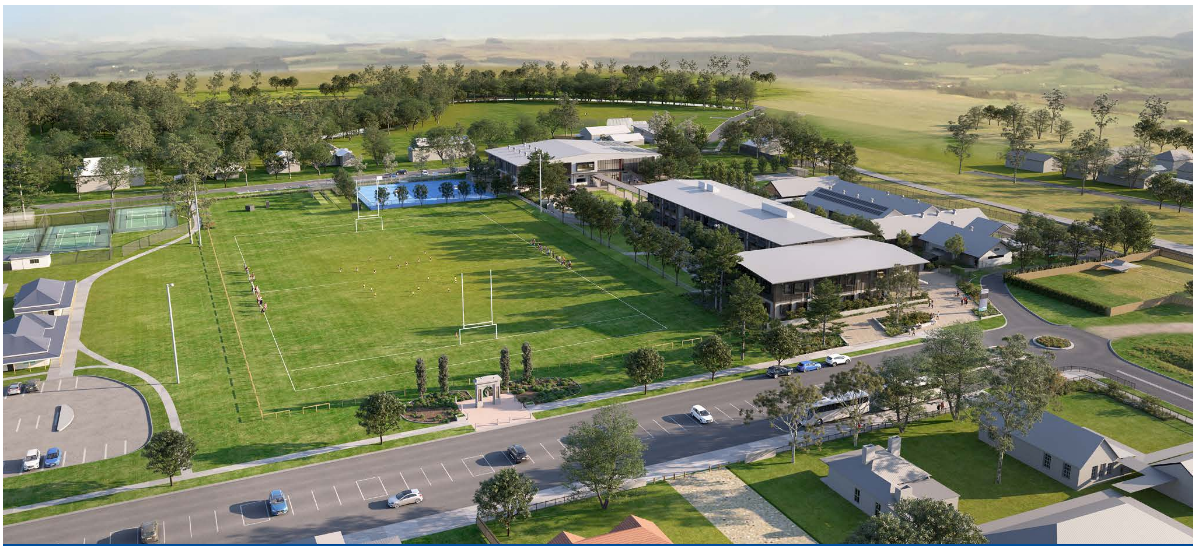
Looking across Bungendore Public School to Gibraltar Street and the proposed new high school.