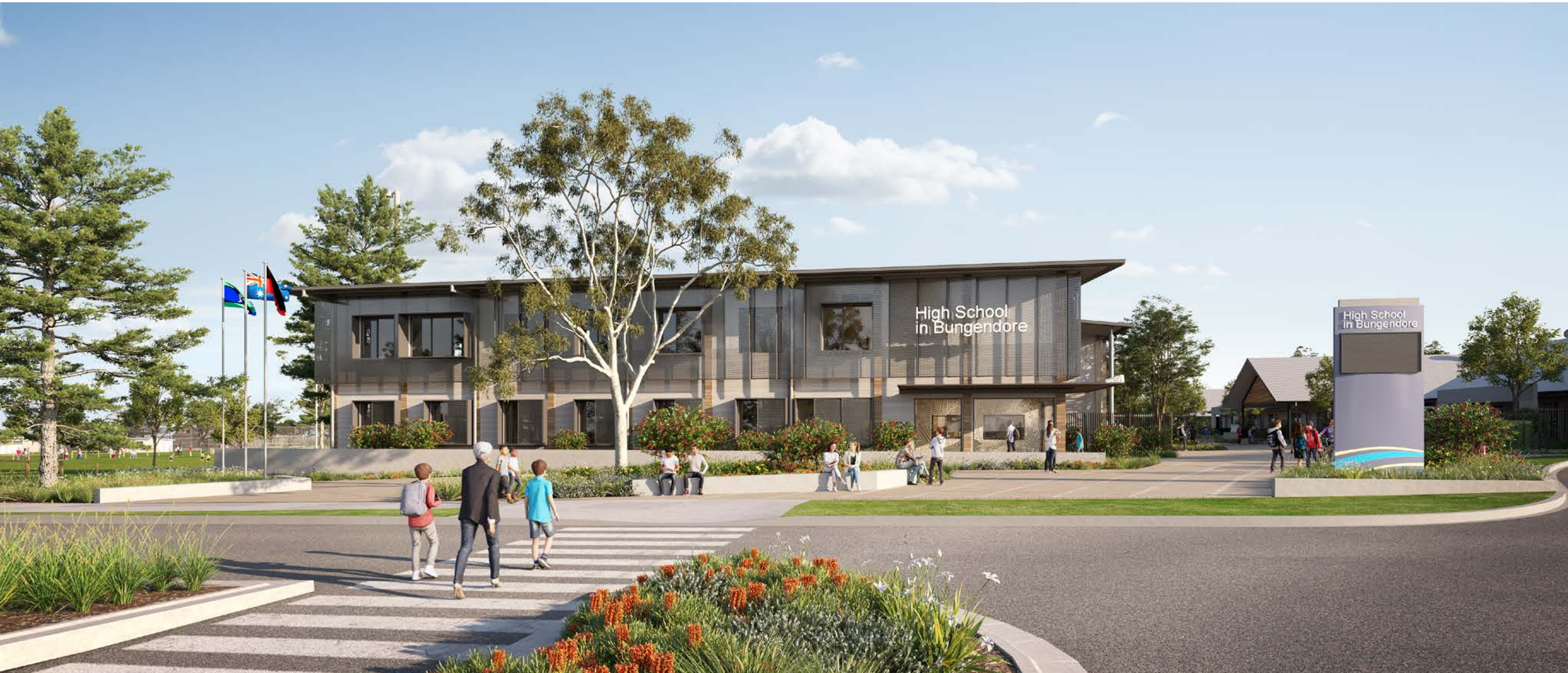
The proposed new high school will be located in the Majara/Gibraltar Streets precinct with a connection to Bungendore Public School by a pedestrian crossing on Gibraltar Street.

Artist impressions of the new high school in Bungendore. All artist impressions are indicative only and subject to change.