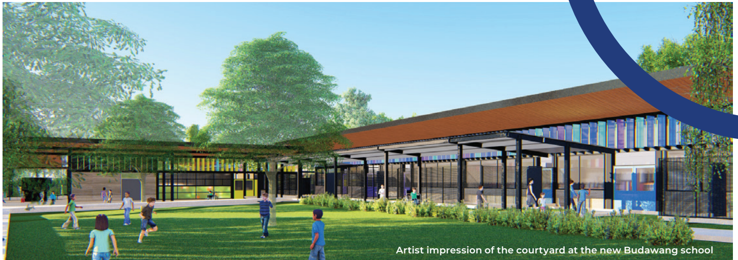
Artist impression of the courtyard at the new Budawang school