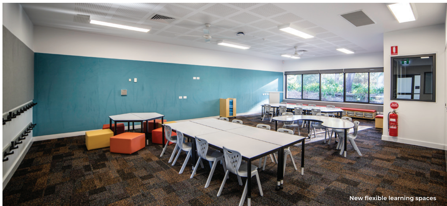
New flexible learning spaces