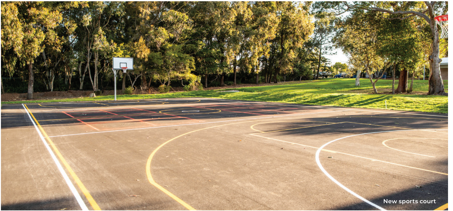
New sports court