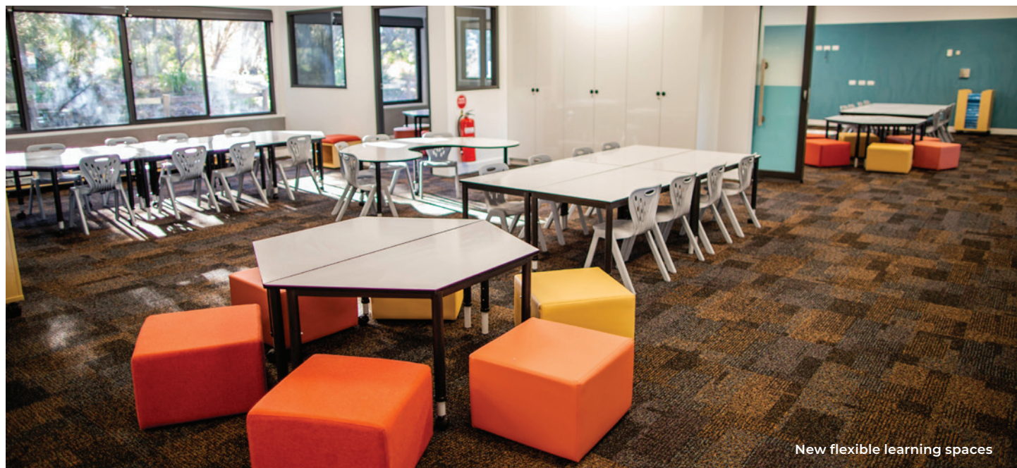
New flexible learning spaces