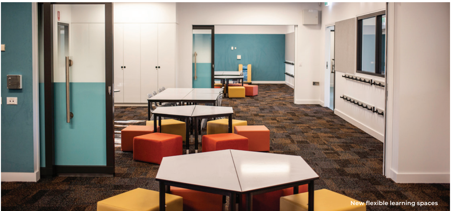
New flexible learning spaces