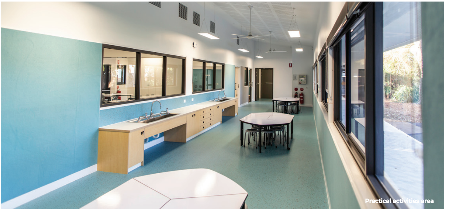
Practical activities area