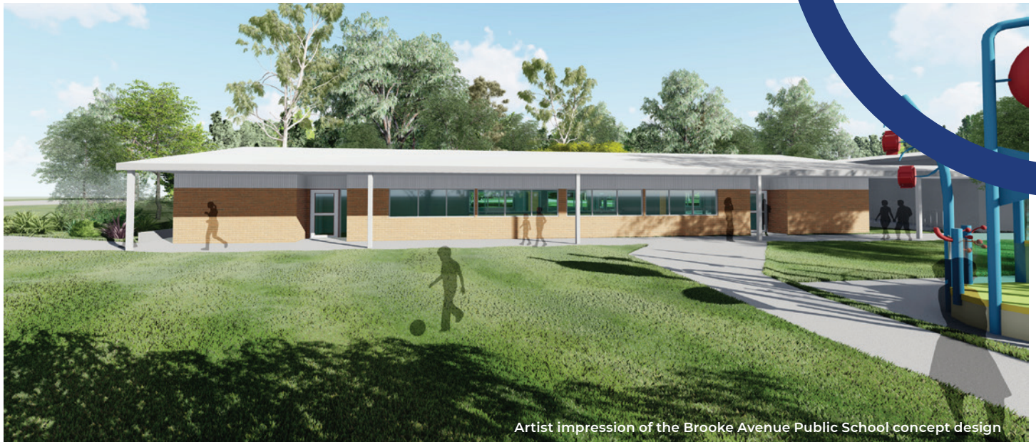
Artist impression of the Brooke Avenue Public School concept design