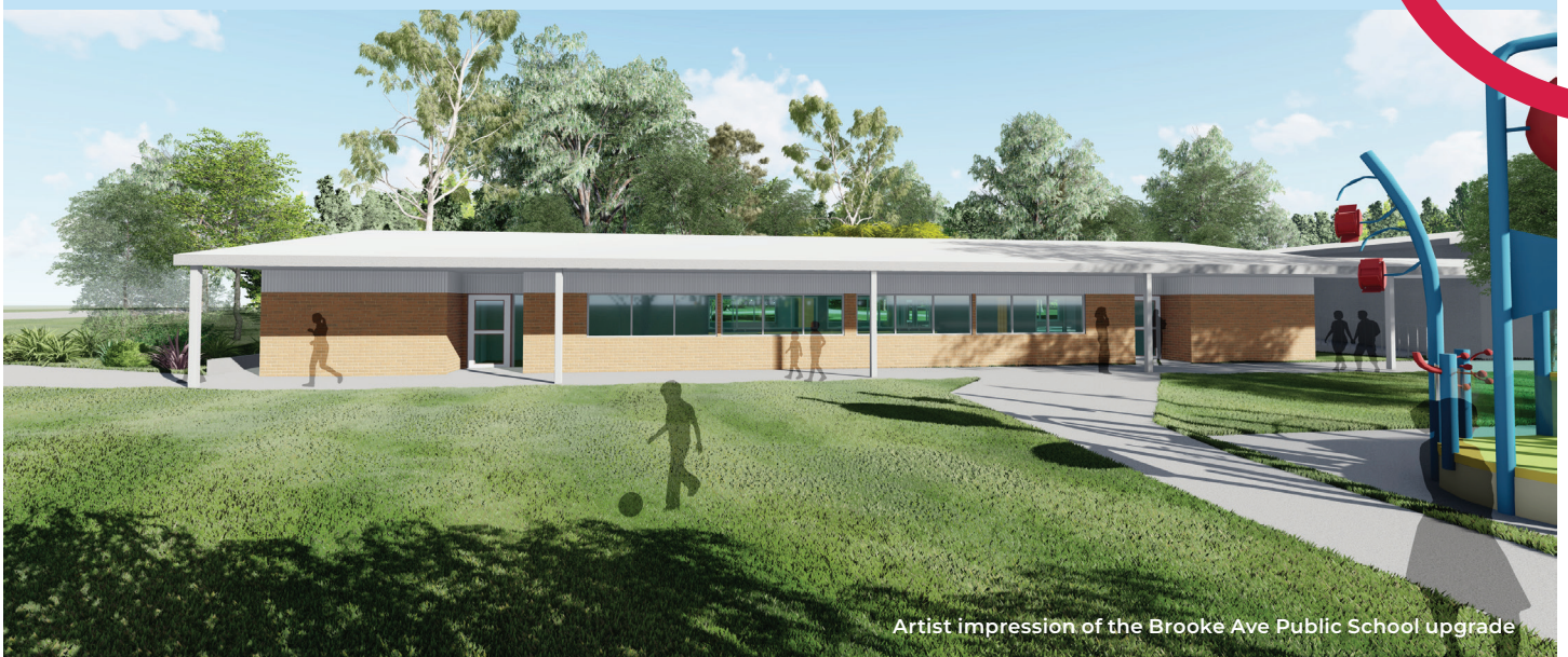
Artist impression of the Brooke Ave Public School upgrade

The NSW Government is investing $7 billion over the next four years, continuing its program to deliver more than 200 new and upgraded schools to support communities across NSW. This is the largest investment in public education infrastructure in the history of NSW.