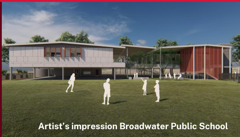
Artist's impression Broadwater Public School