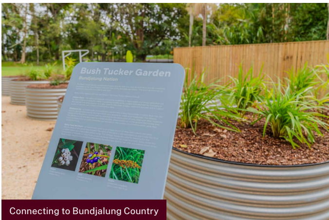
Connecting to Bundjalung Country