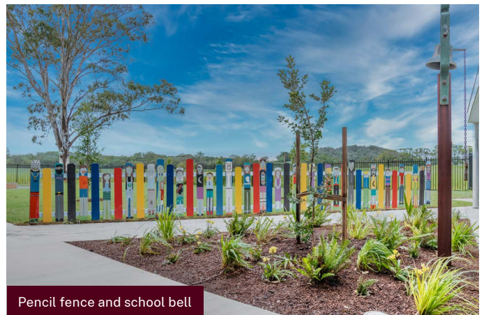
Pencil fence and school bell