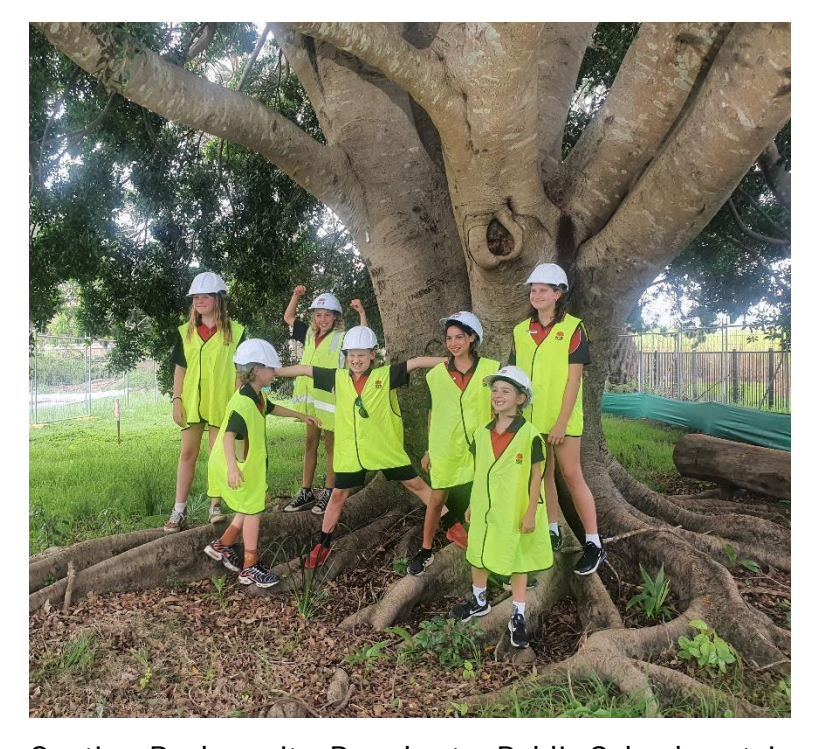
Caption: Back on site, Broadwater Public School captains and SRC visit the "love tree"

Email: school in frastructure @ det.nsw.edu.au