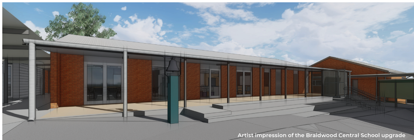
Artist impression of the Braidwood Central School upgrade