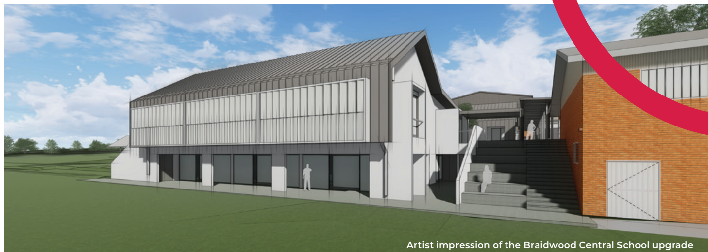
Artist impression of the Braidwood Central School upgrade