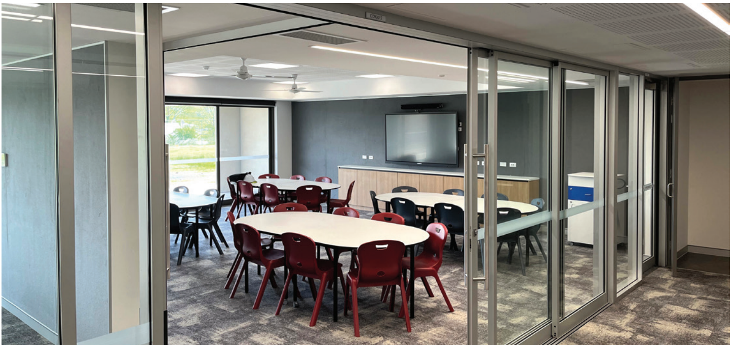
A new flexible learning space in new Building 1