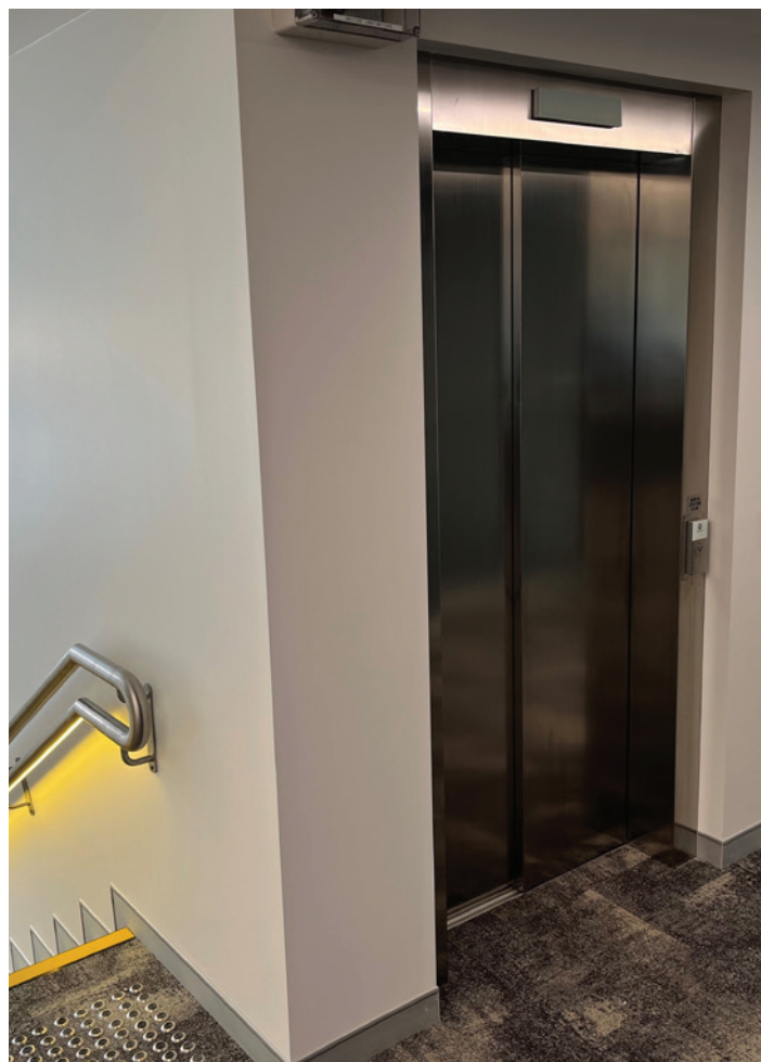
The school's new lift in Building 1

A lift was installed in Building 1 to make its level 2 classrooms accessible.