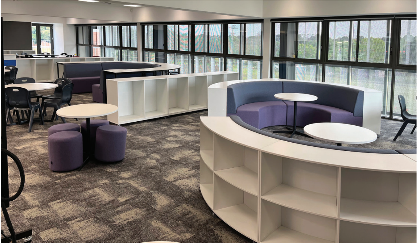
A new flexible learning space in Building 1