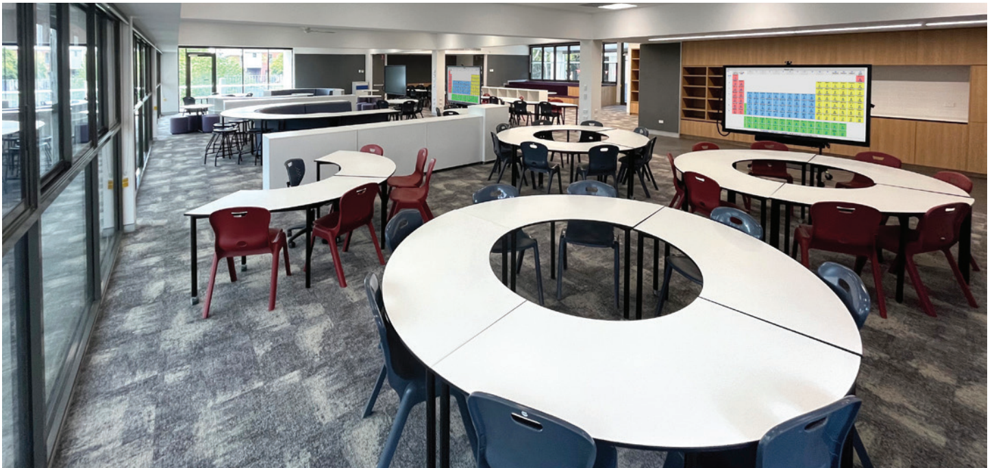
A new flexible learning space in new Building 1