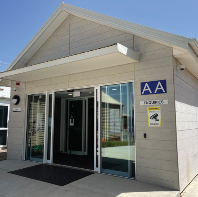
The new administration building