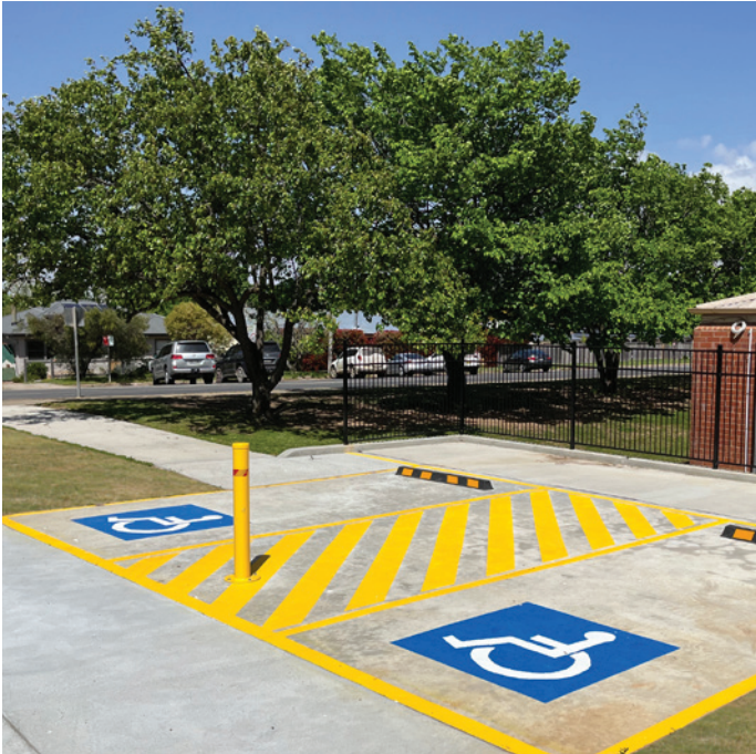
The new accessible car park