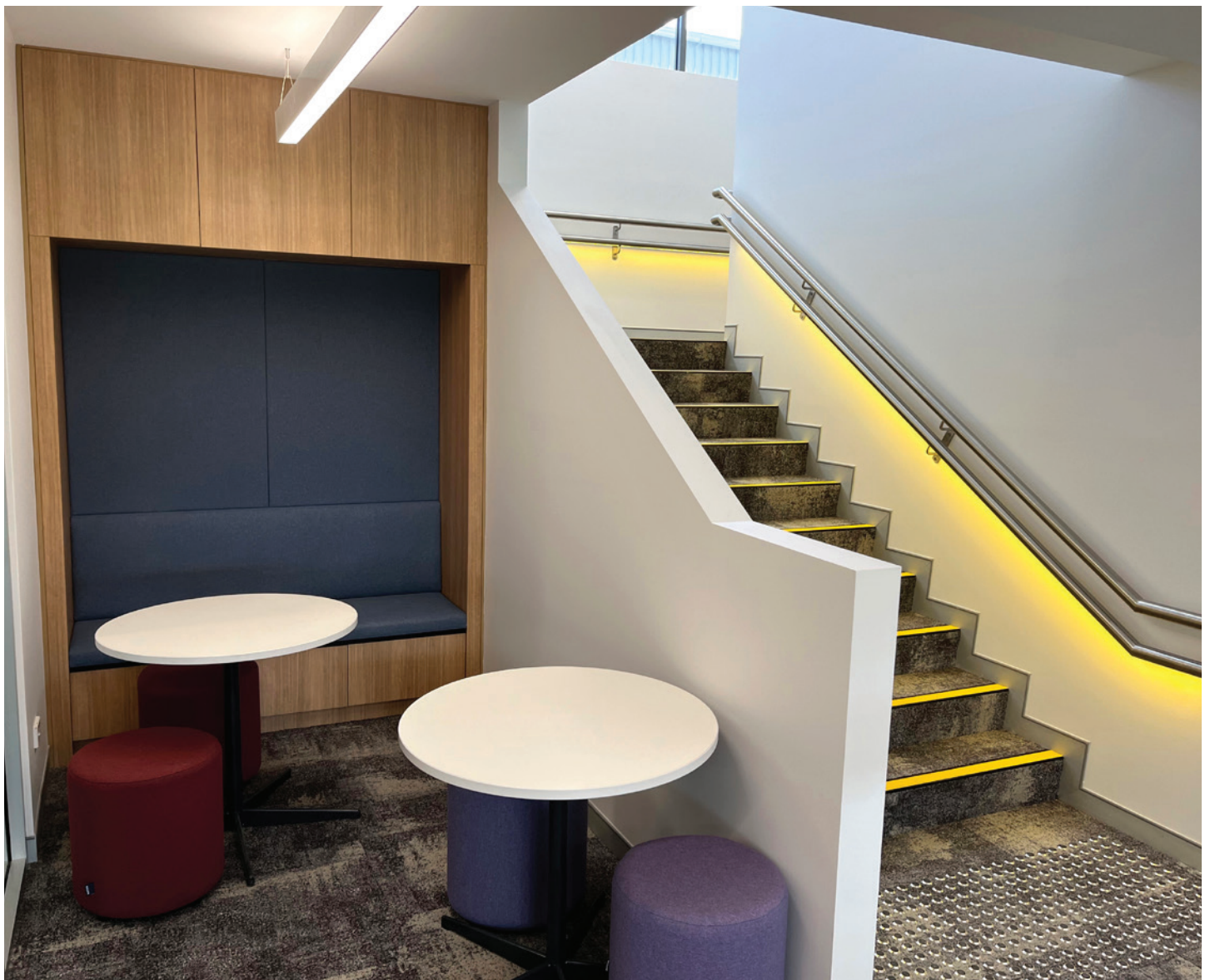
A new meeting nook in Building 1