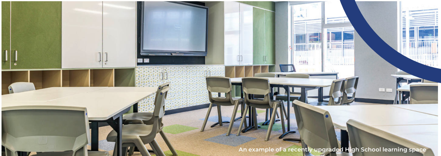
An example of a recently upgraded High School learning space