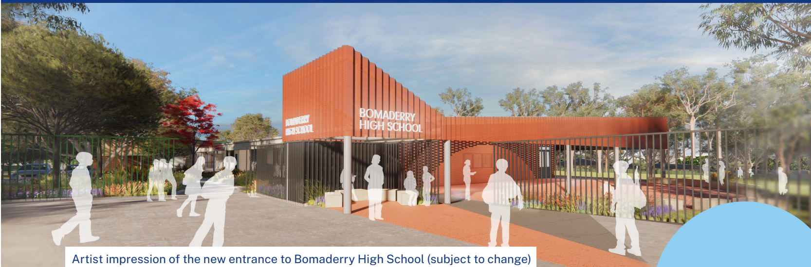
Artist impression of the new entrance to Bomaderry High School (subject to change)