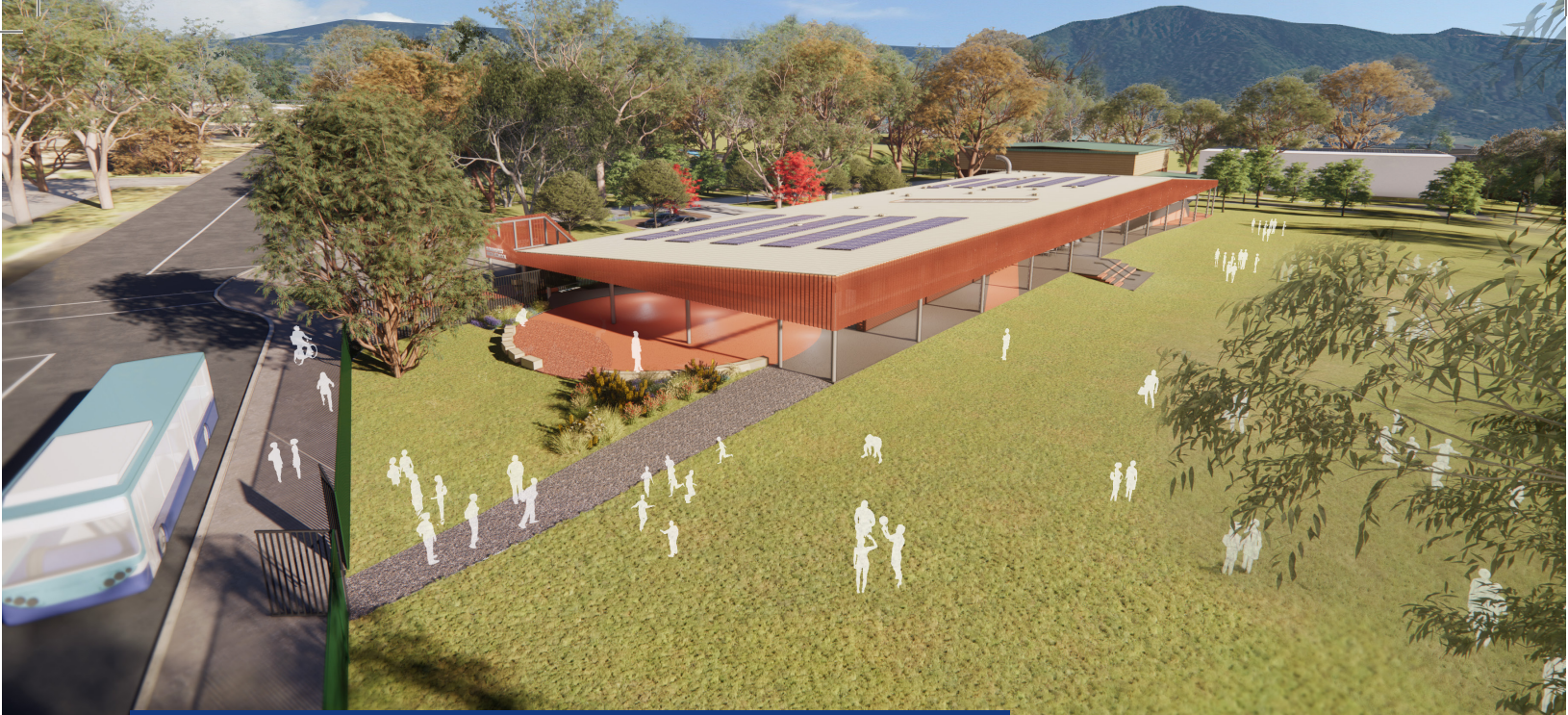
Artist impression showing an aerial view of the new building (subject to change)