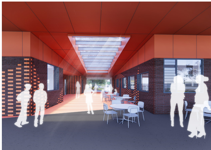
Artist impression of the central area (subject to change)

We are currently discussing design options with our Connecting with Country consultant in partnership with local Aboriginal Knowledge Holders and will share design initiatives once finalised.