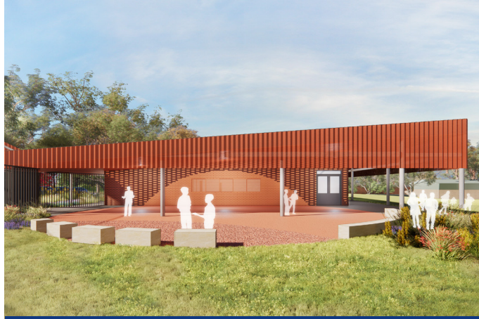
Artist impression of the front of the new building (subject to change)

Buildings A, B, D and E will be refurbished and reconfigured to improve the provision and quality of classrooms and facilities for science, visual arts, performance and fitness, as well as facilities for specialist support classes.