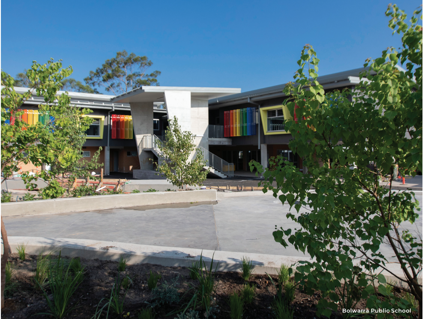
Bolwarra Public School