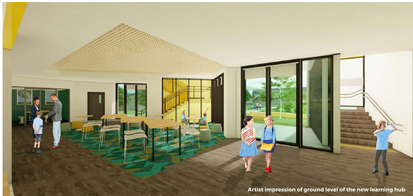
Artist impression of ground level of the new learning hub

The Bletchington Public School upgrade will increase the number of permanent learning spaces available at the school, refurbish existing learning spaces to support modern collaborative teaching pedagogy, and upgrade the hall.