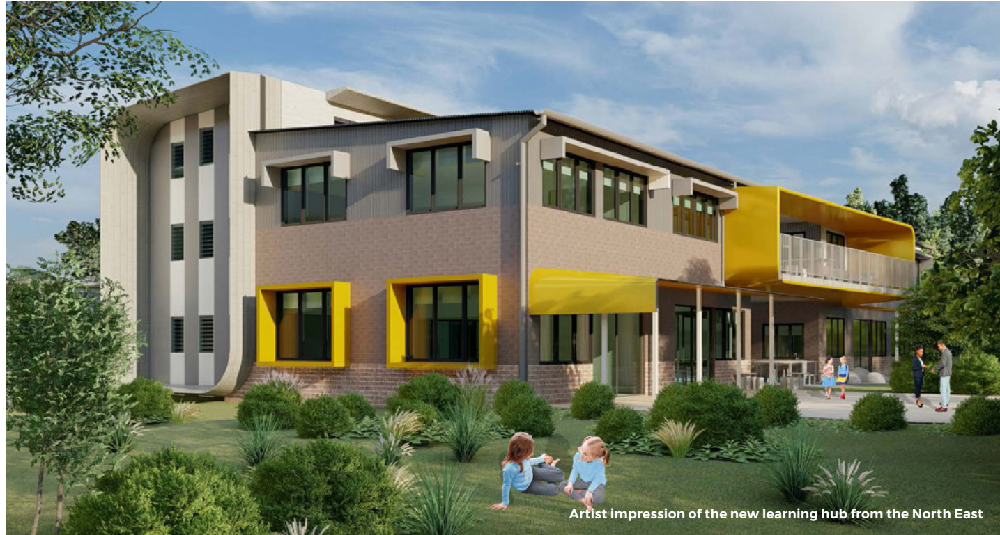
Artist impression of the new learning hub from the North East