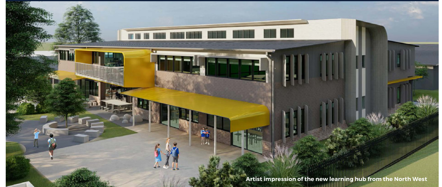
Artist impression of the new learning hub from the North West

The NSW Government is investing $6.7 billion to deliver more than 190 new and upgraded schools to support communities across NSW. This is the largest investment in public education infrastructure in the history of NSW.