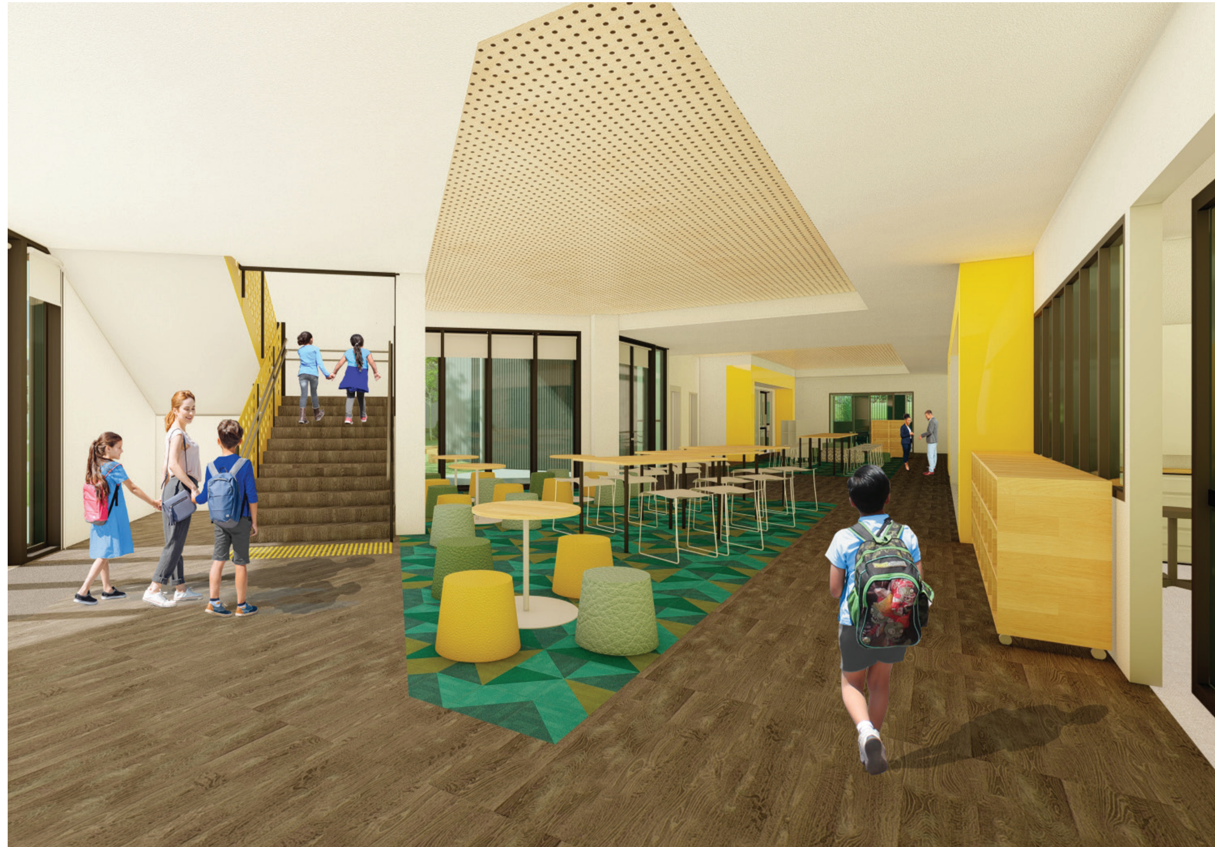
Artist impression – proposed new learning hub from the Park Street gate entry

Your feedback on this project is important to us. For more information, questions or to make a comment please email us at schoolinfrastructure@det.nsw.edu.au or phone 1300 482 651.