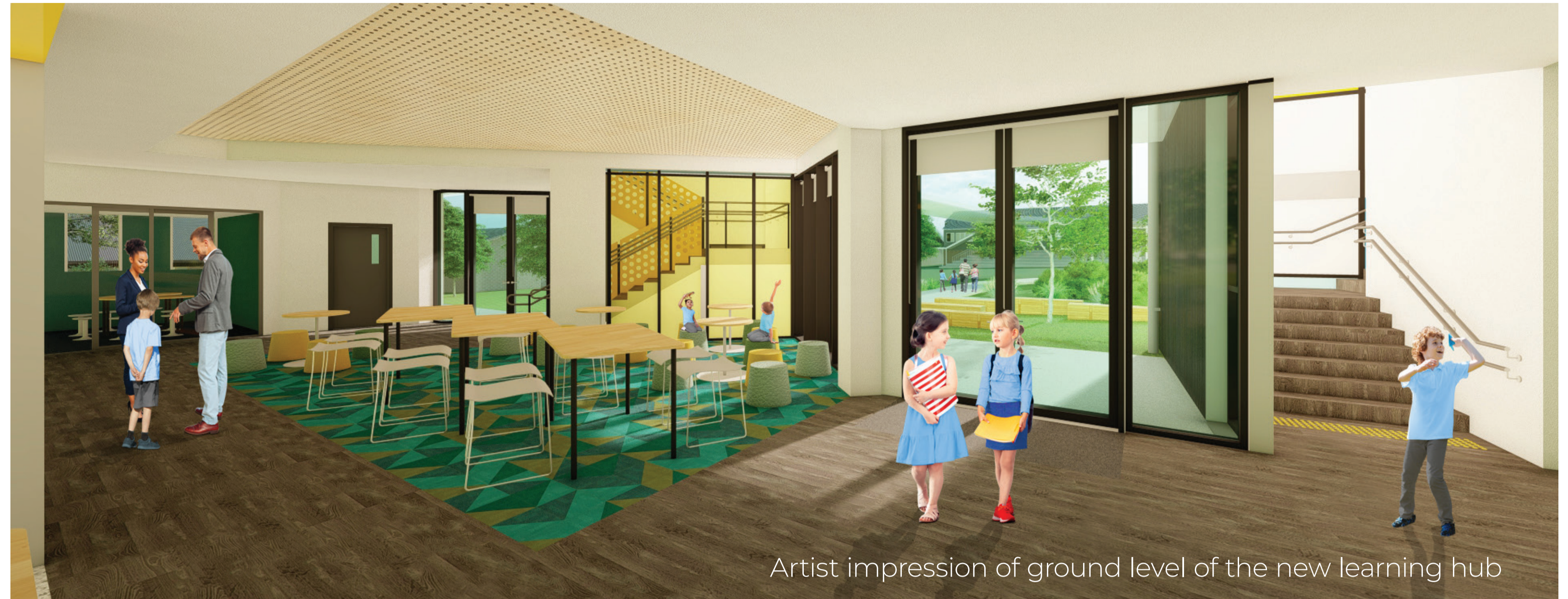
Artist impression of ground level of the new learning hub