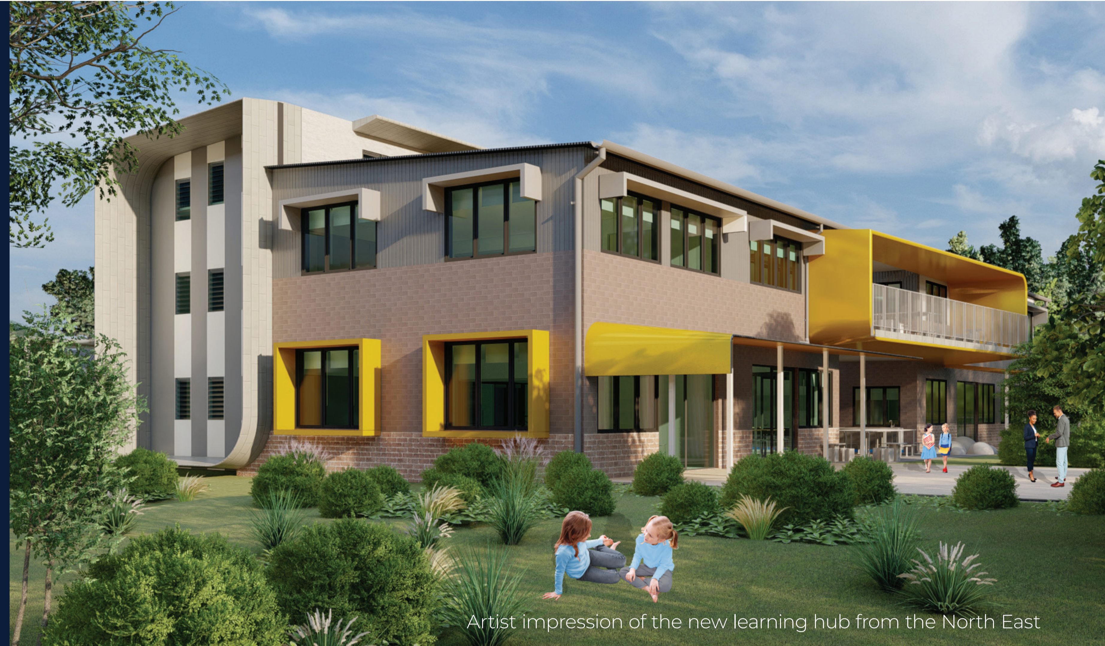
Artist impression of the new learning hub from the North East