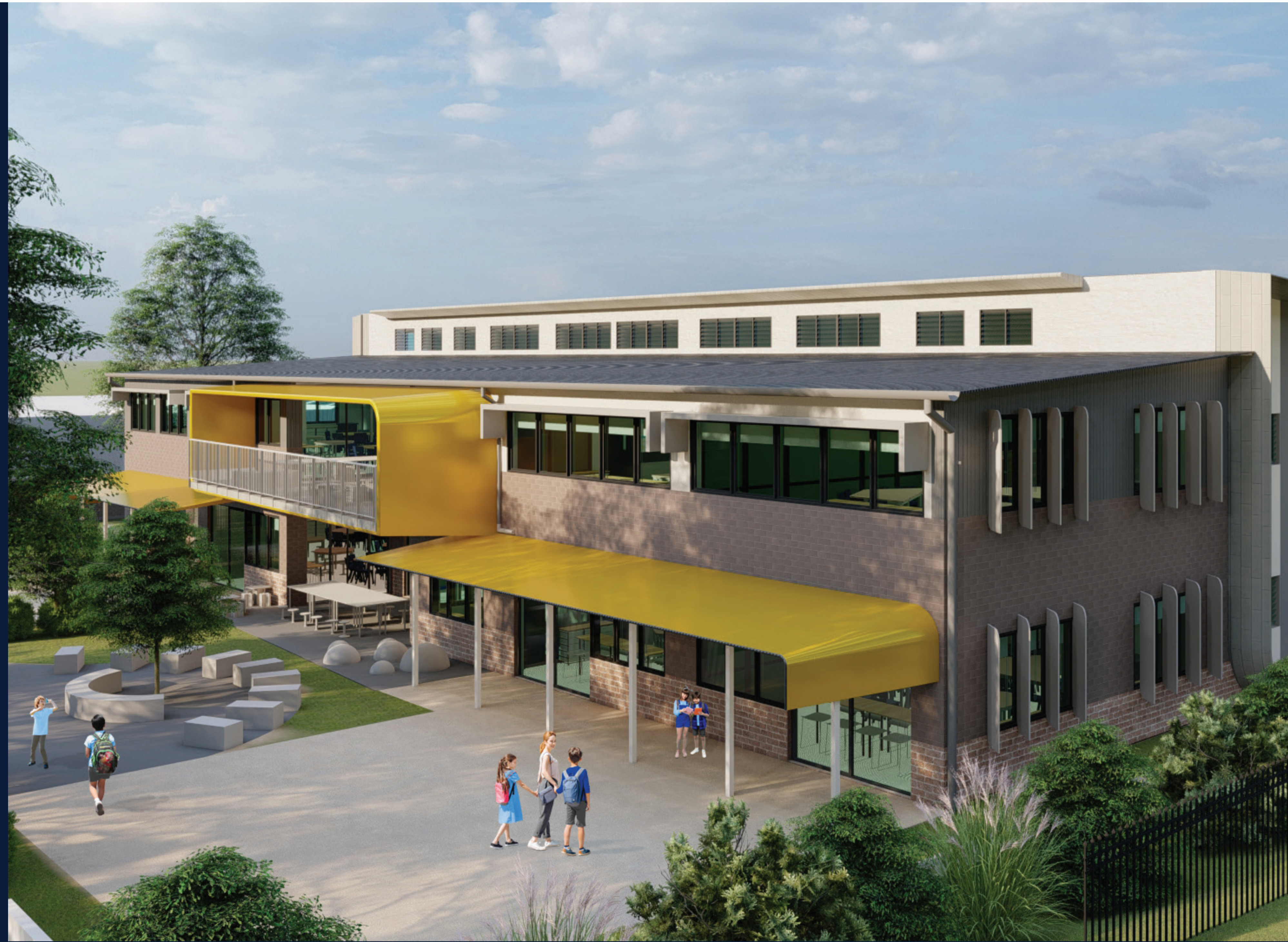
Artist impression of the new learning hub from the North West