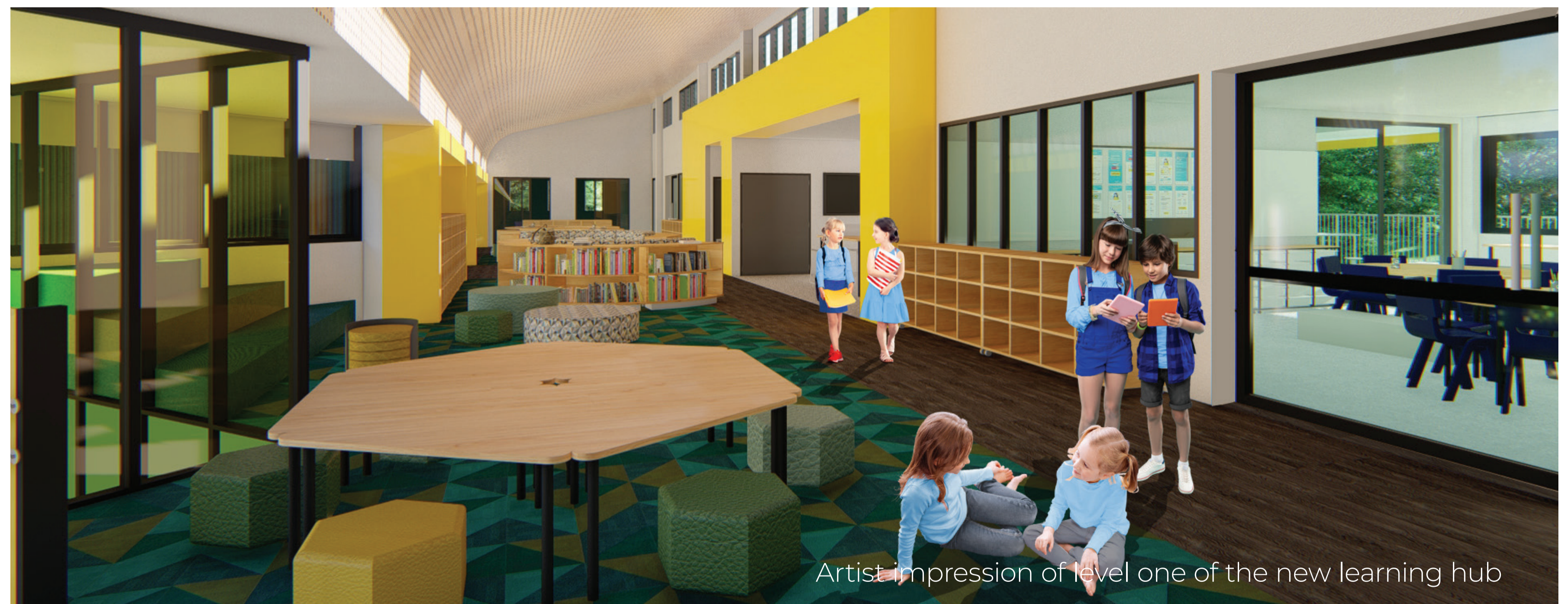
Artist impression of level one of the new learning hub