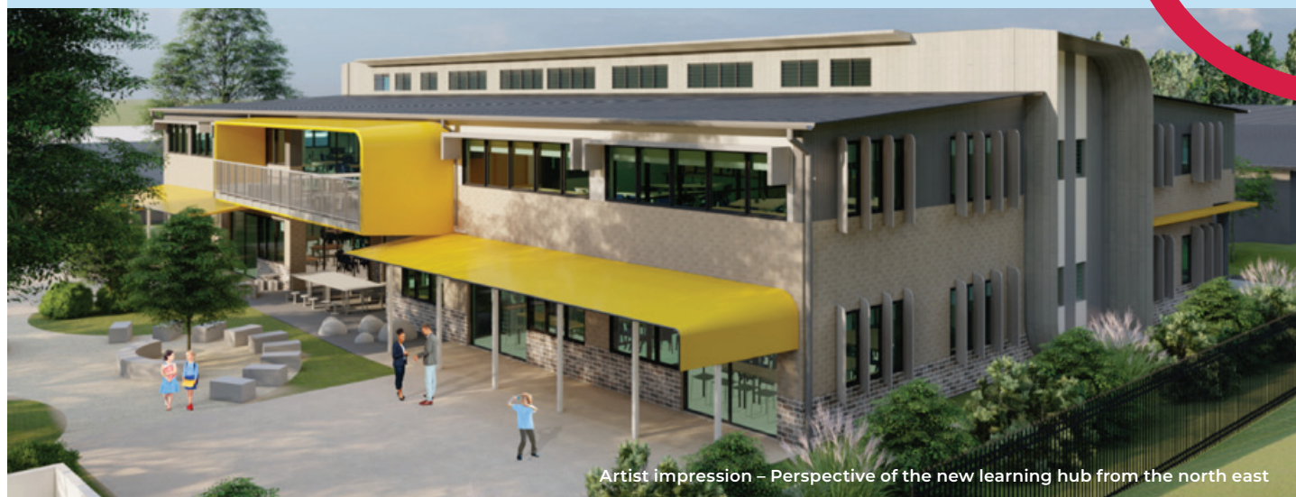
Artist impression – Perspective of the new learning hub from the north east

The NSW Government is investing $7.9 billion over the next four years, continuing its program to deliver 215 new and upgraded schools to support communities across NSW. This is the largest investment in public education infrastructure in the history of NSW.