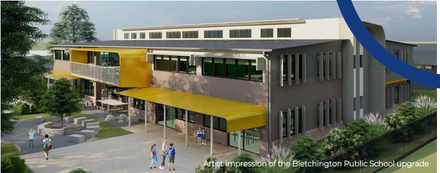
Artist impression of the Bletchington Public School upgrade