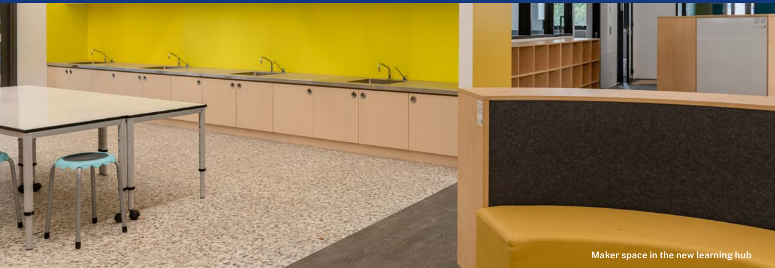
Maker space in the new learning hub