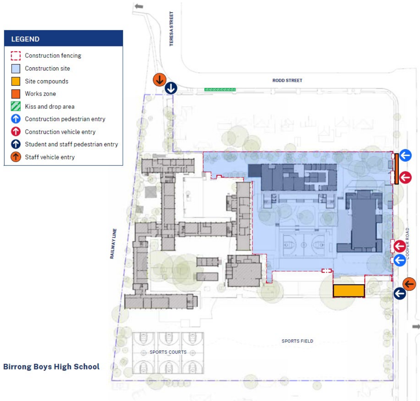
Birrong Boys High School