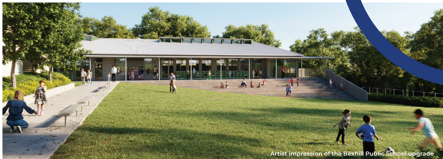
Artist impression of the Bexhill Public School upgrade