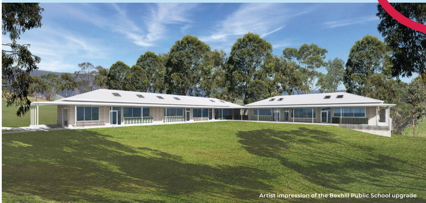
Artist impression of the Bexhill Public School upgrade

The NSW Government is investing $7 billion over the next four years, continuing its program to deliver more than 200 new and upgraded schools to support communities across NSW. This is the largest investment in public education infrastructure in the history of NSW.