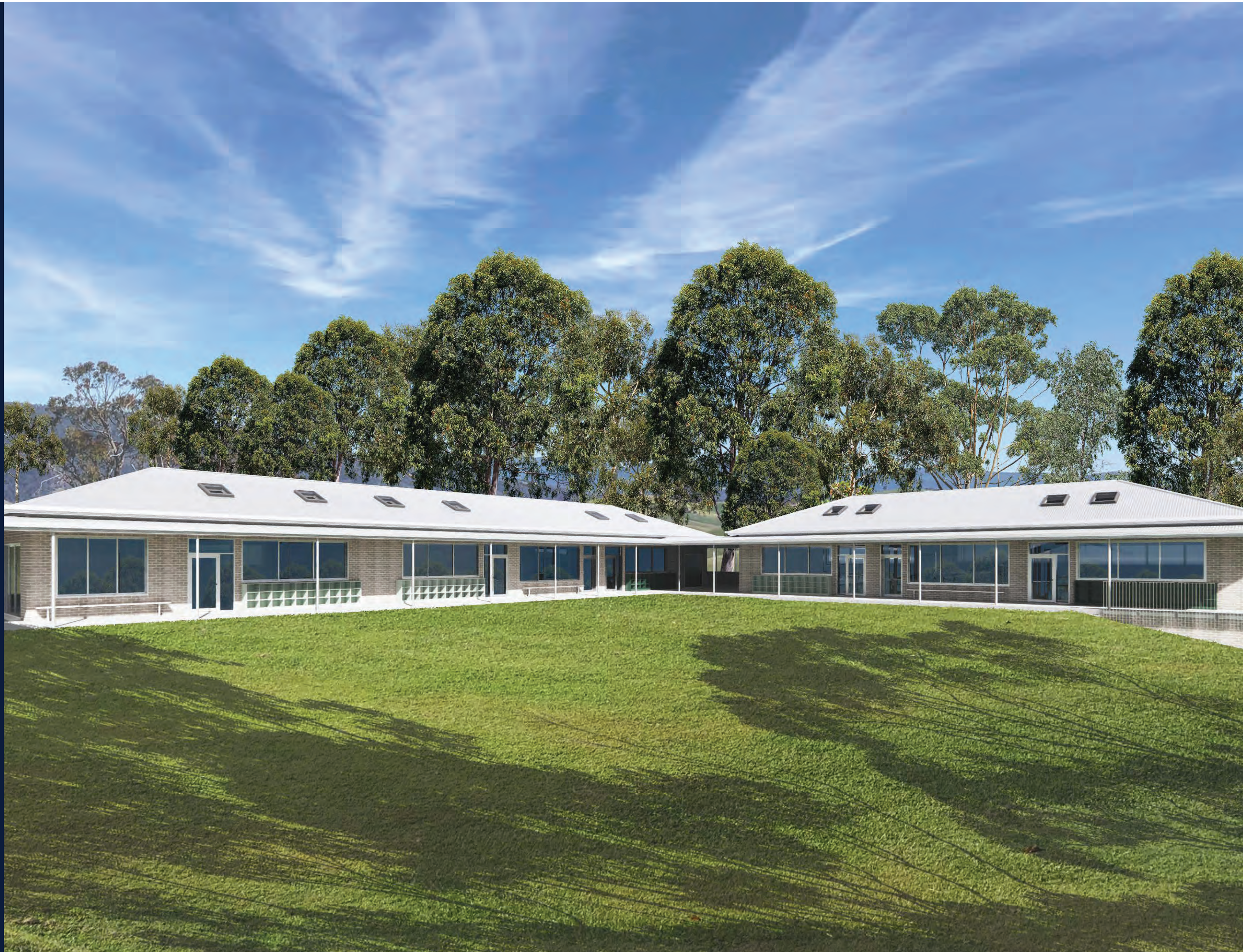
Artist impression of the Bexhill Public School upgrade