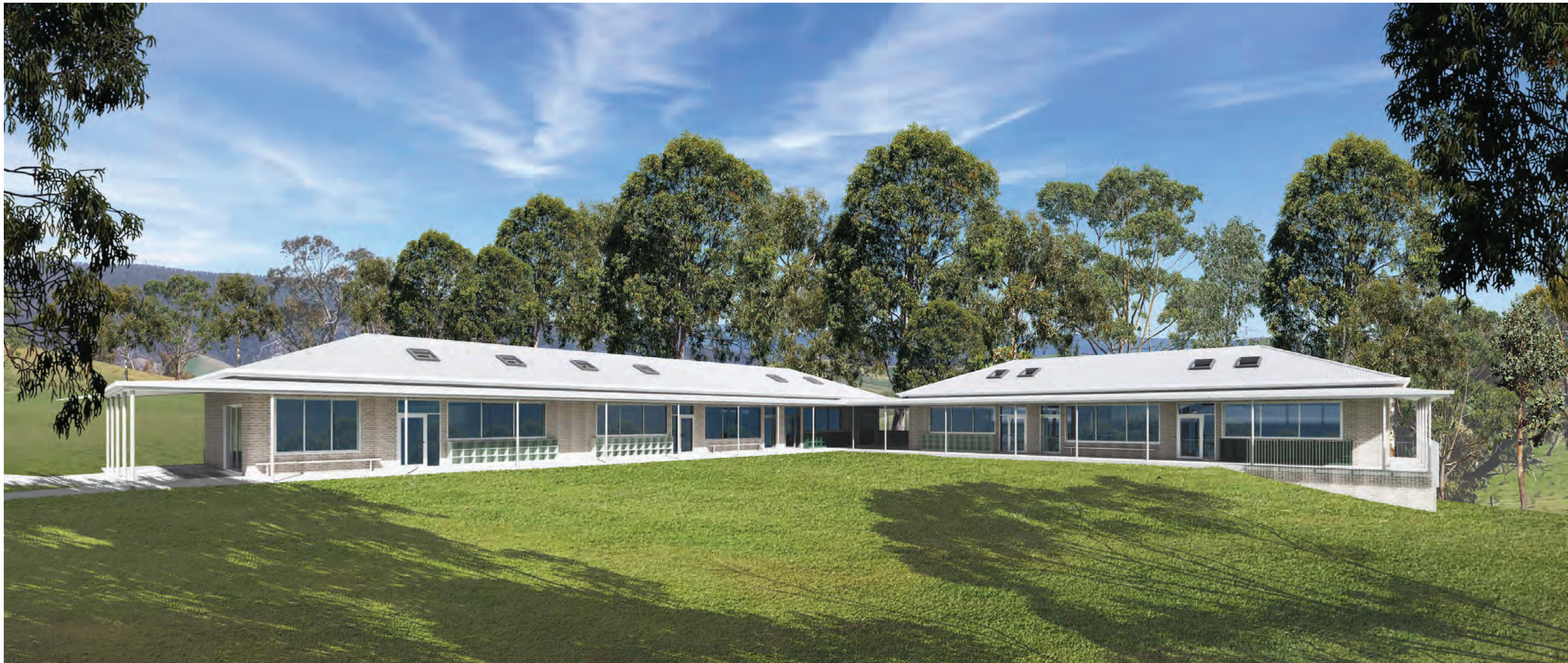
Artist impressions of the Bexhill Public School upgrade