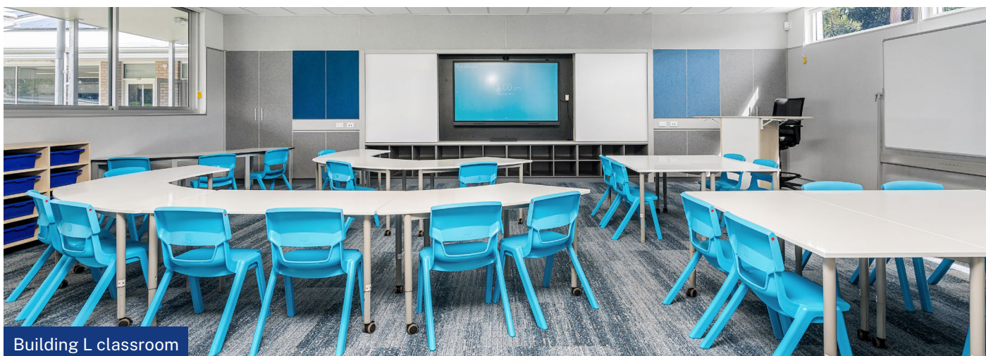
Building L classroom