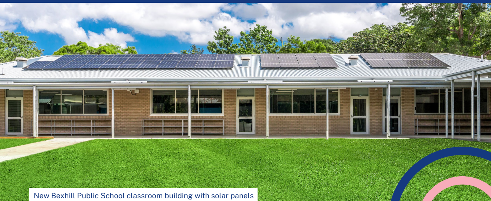
New Bexhill Public School classroom building with solar panels