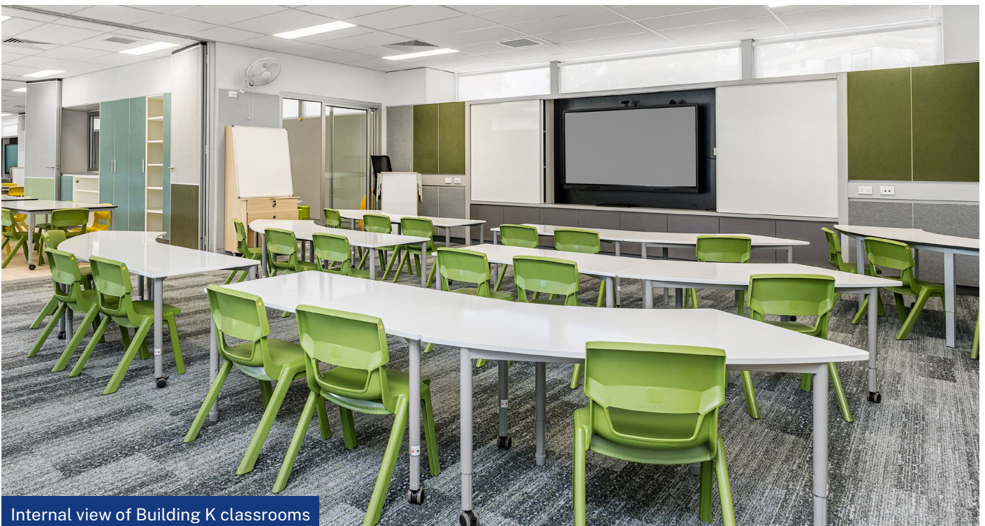
Internal view of Building K classrooms