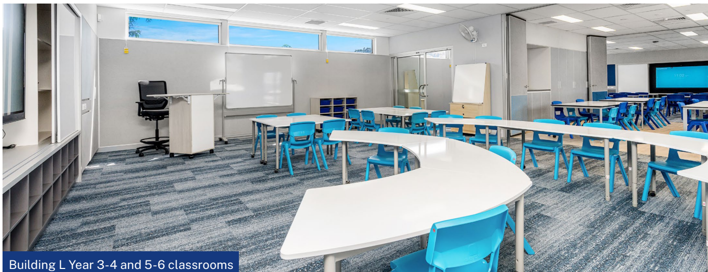
Building L Year 3-4 and 5-6 classrooms