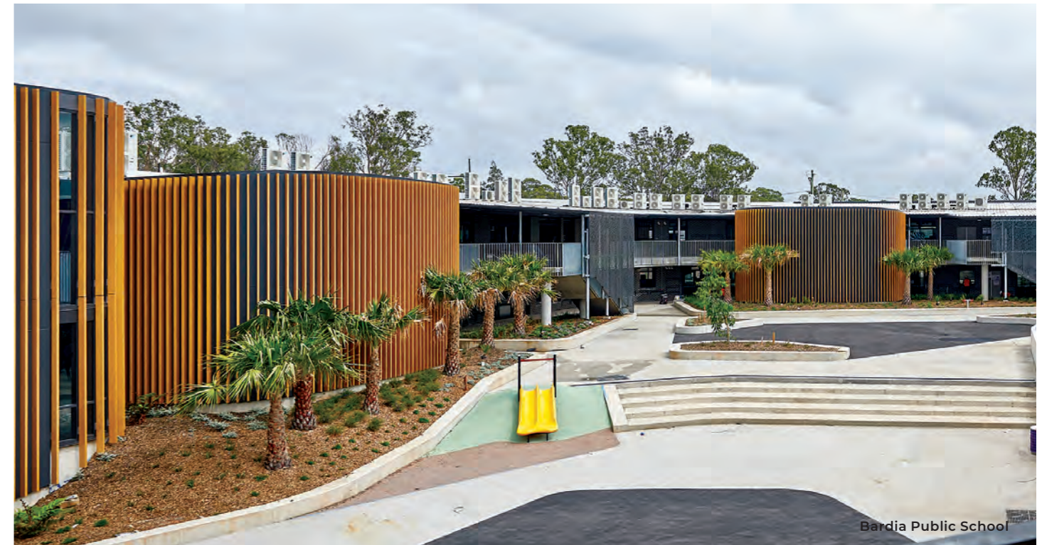
Bardia Public School

Temporary fencing will be in place to separate the completed (Stage 1) works from the remaining Stage 2 works.