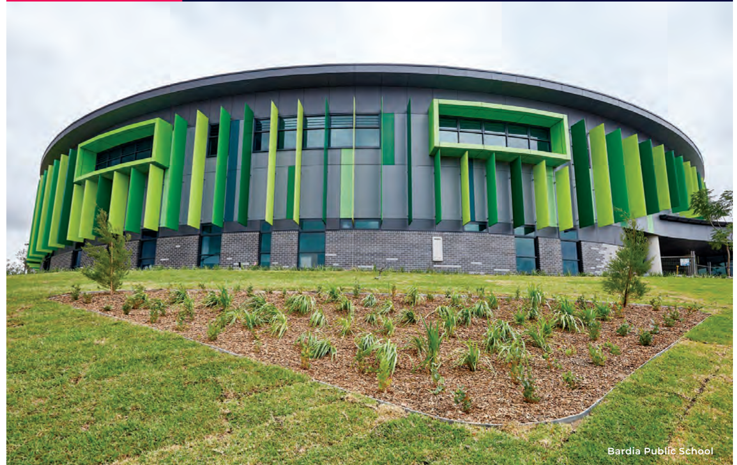
Bardia Public School