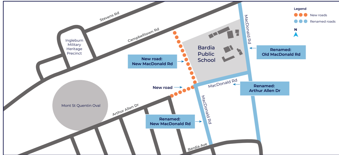
Road access to Bardia Public School