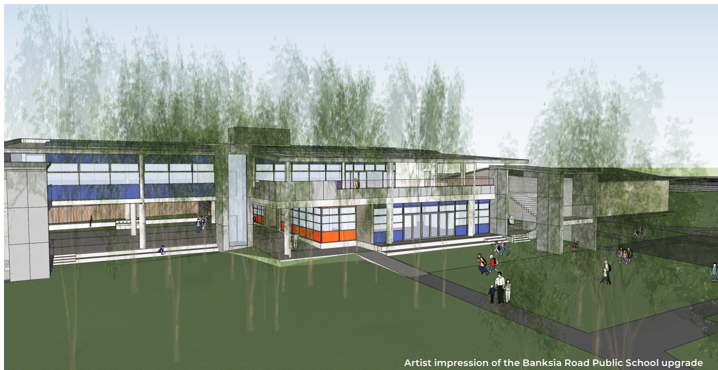
Artist impression of the Banksia Road Public School upgrade