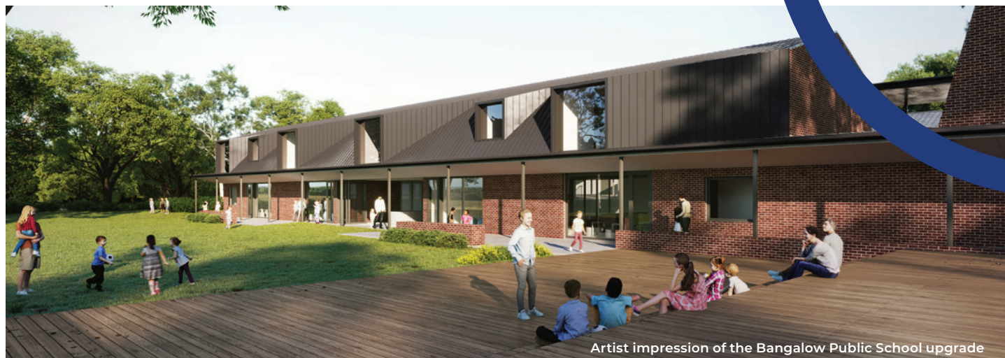
Artist impression of the Bangalow Public School upgrade