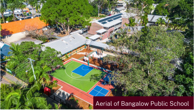
Aerial of Bangalow Public School