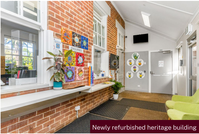
Newly refurbished heritage building

The heritage building (Building A) has been carefully refurbished as modern school administration and staff facilities that retain the heritage fabric of the original school rooms. As part of the department's ongoing maintenance programs, the roof of the building has also been replaced with materials that match the original school building.