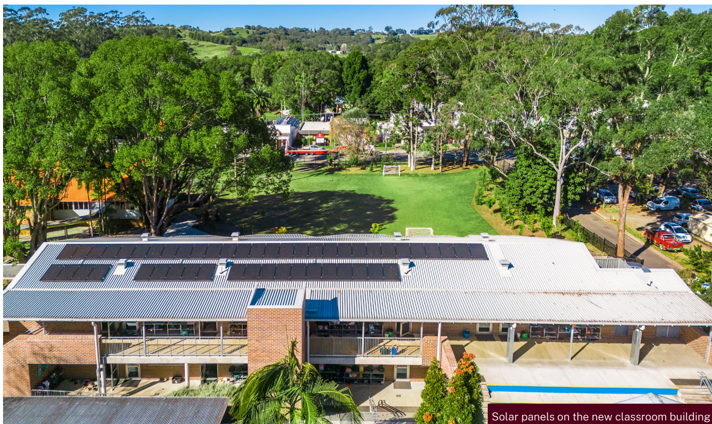
Solar panels on the new classroom building