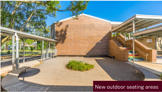
New outdoor seating areas

Landscaping includes new native trees, shaded curved seating areas and pathways to better open and connect Bangalow Public School's space. The new classroom building includes a tiered seating area connected to the school hall.