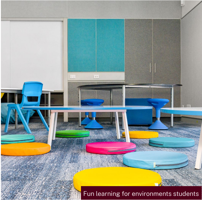
Fun learning for environments students

As part of the NSW Government's commitment to sustainability in schools, rooftop solar panels have been installed on the new building.