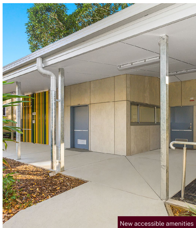
New accessible amenities