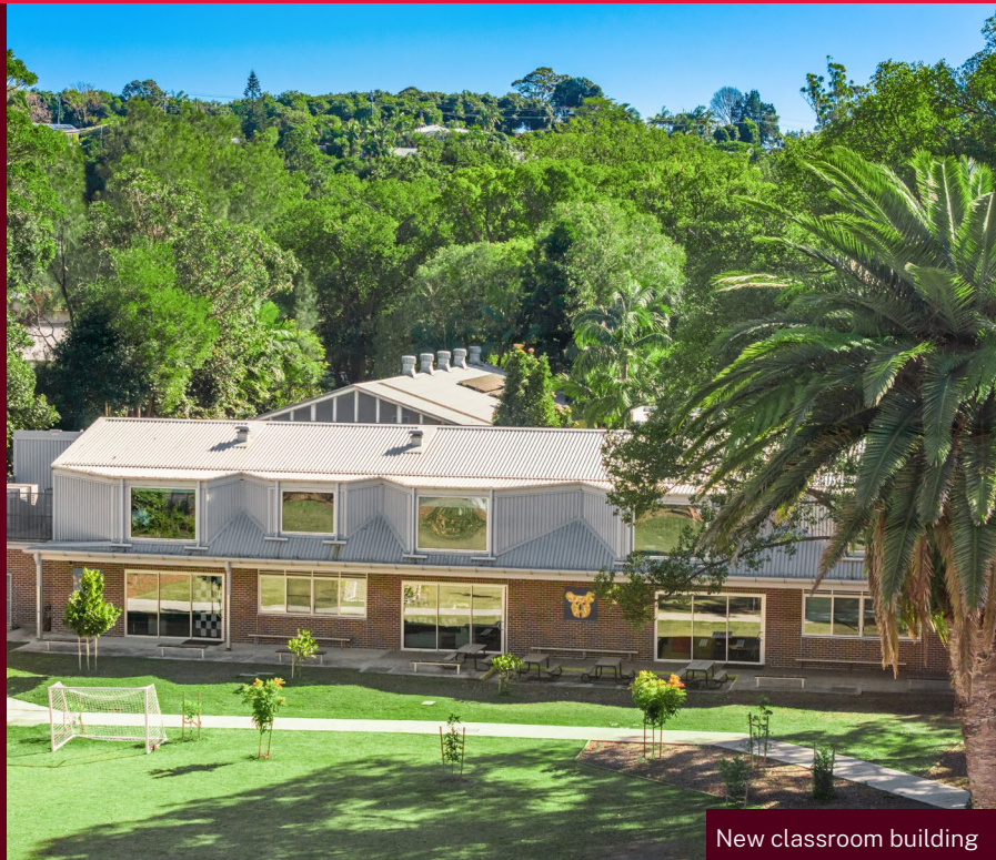
New classroom building

The upgrade to Bangalow Public School is now finished and all areas are open for use.