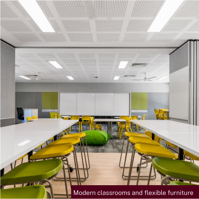
Modern classrooms and flexible furniture