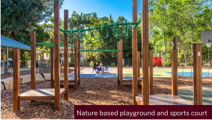
Nature based playground and sports court

The upgrade includes a new multi-purpose sports court for student games, returfed school ovals, and a nature-based playground that was jointly funded by Bangalow Public School, and the Bangalow Public School P&C.