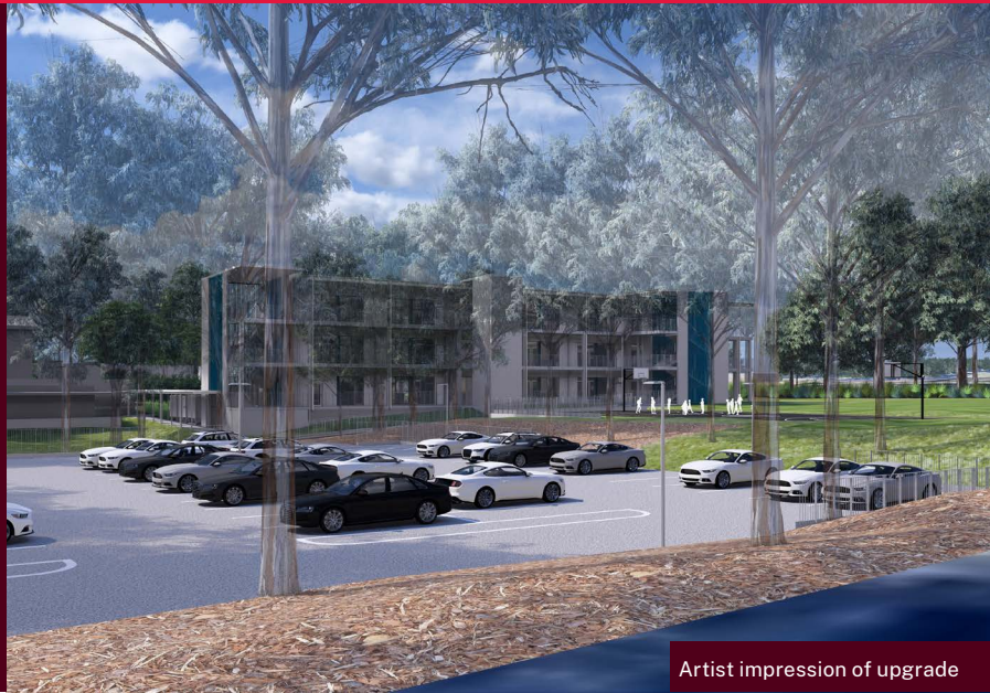
Artist impression of upgrade