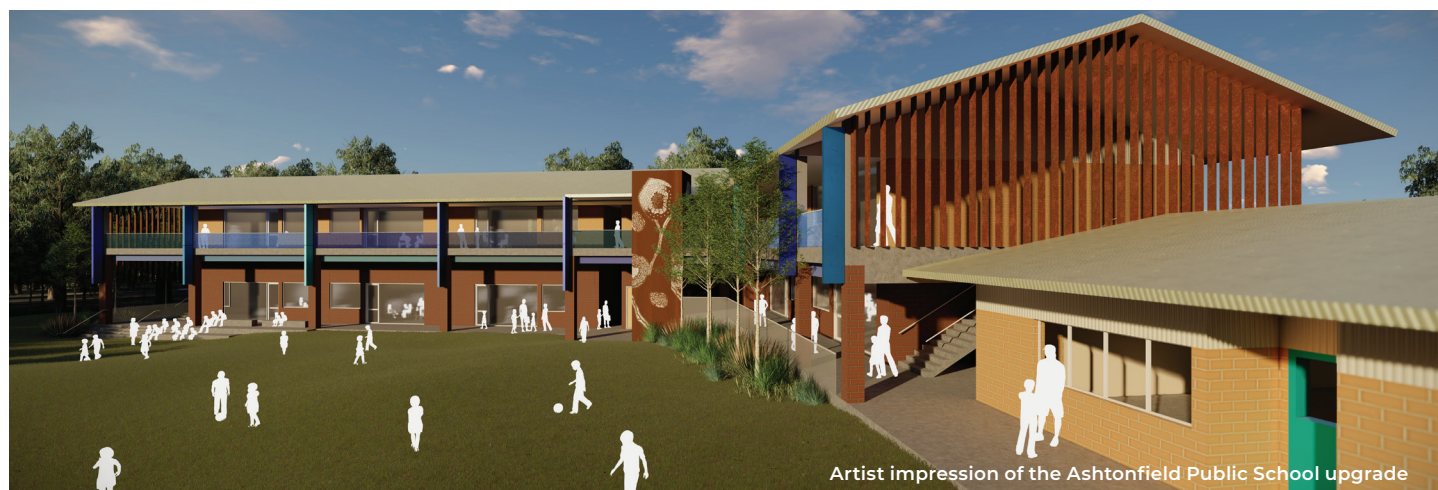
Artist impression of the Ashtonfield Public School upgrade