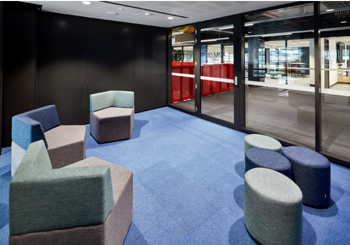
Example of a small seminar room available in Arthur Phillip High School