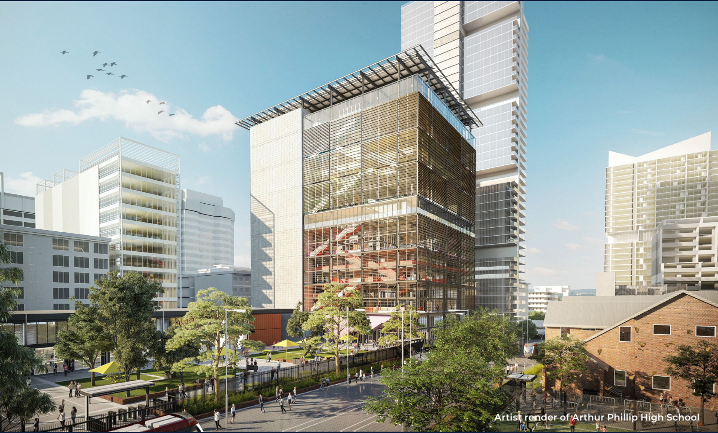
Artist render of Arthur Phillip High School

Information for parents, carers, students and staff November 2019