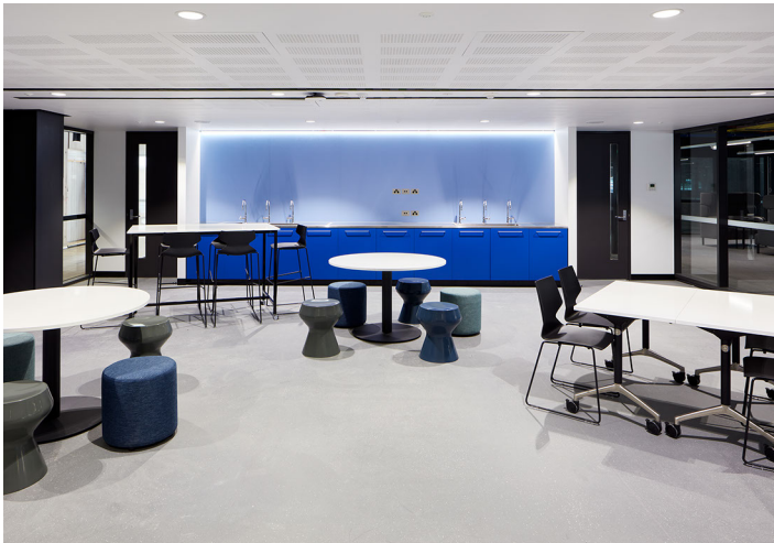
Example of a wet studio learning space available in Arthur Phillip High School