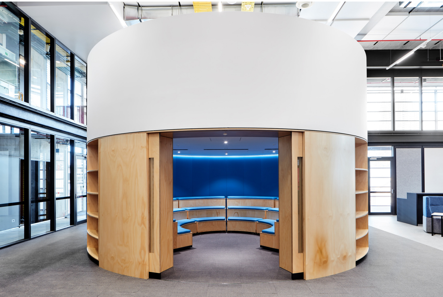
I-hub learning space

Thank you for your patience during these works. We are thrilled to deliver this project for the school community.