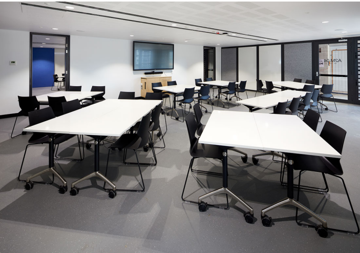
Example of a dry studio learning space available in Arthur Phillip High School