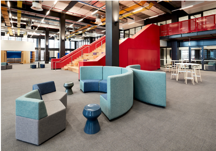
Tiered seating and open learning spaces available for each homebase