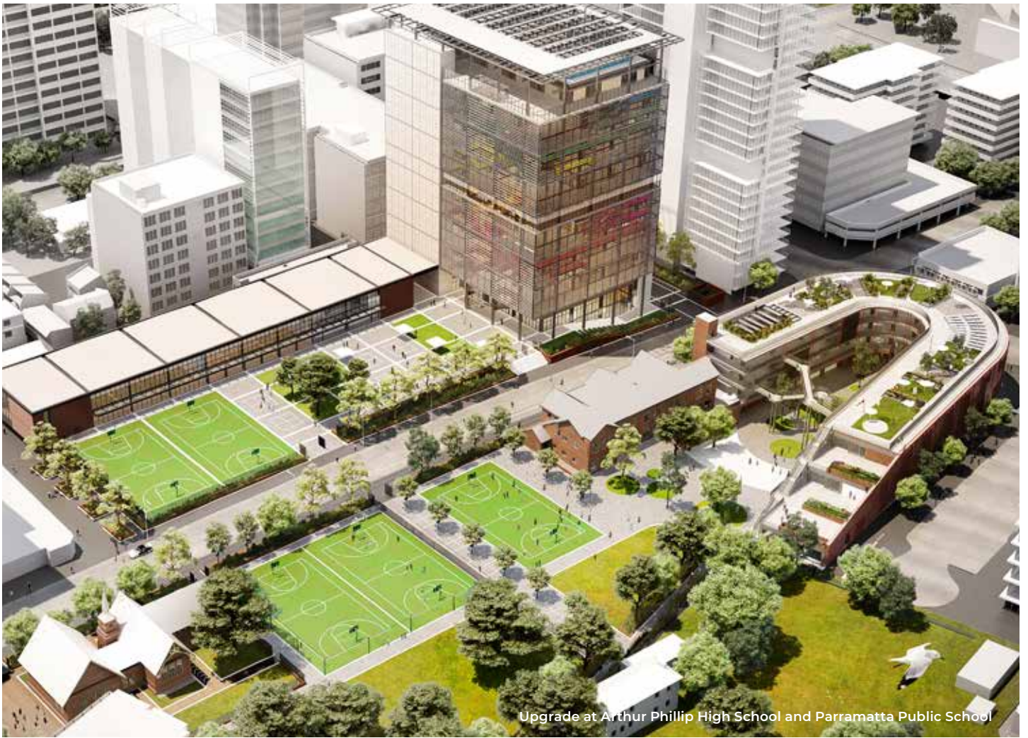
Upgrade at Arthur Phillip High School and Parramatta Public School