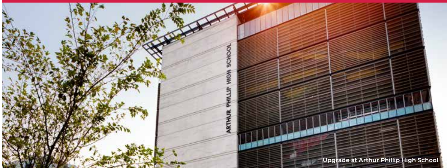
Upgrade at Arthur Phillip High School