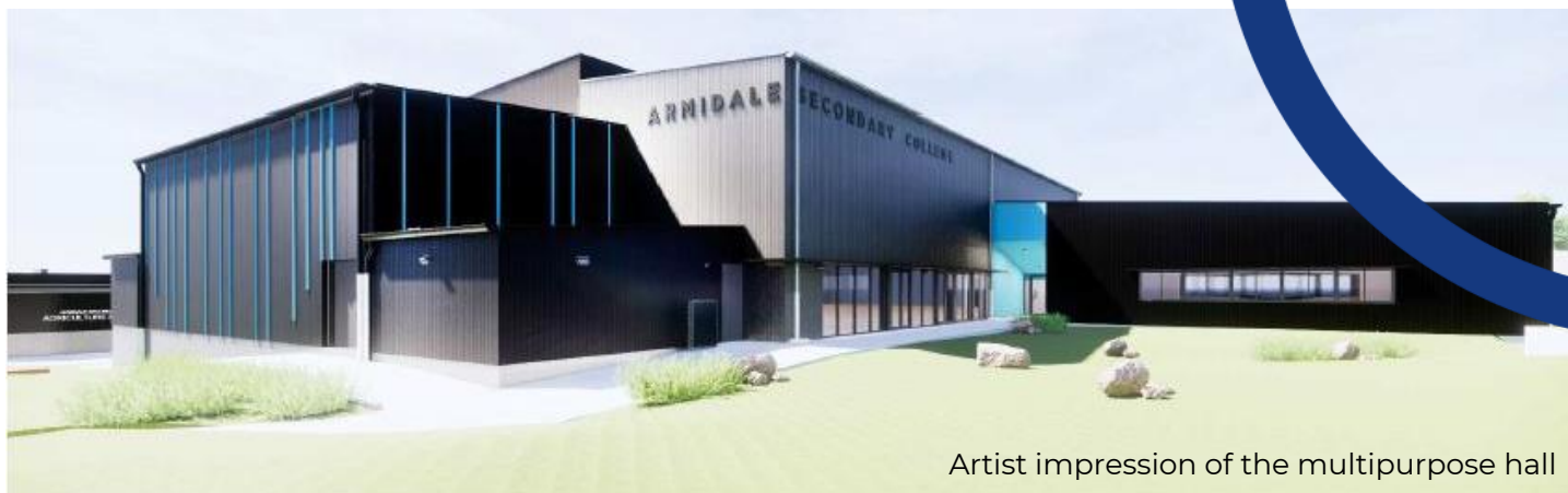
Artist impression of the multipurpose hall