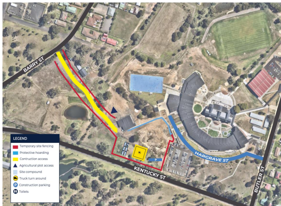
Caption: Site layout of the Armidale Secondary College multipurpose hall