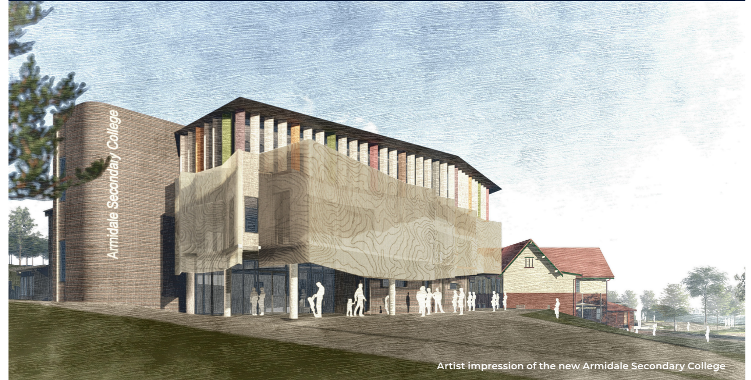
Artist impression of the new Armidale Secondary College

Information pack for students, parents, carers and the community March 2020