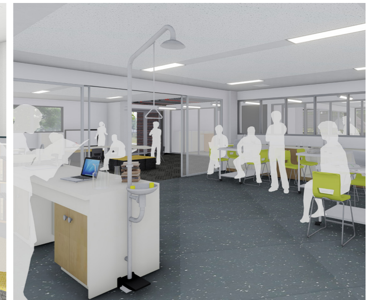
Artist impression of the science lab