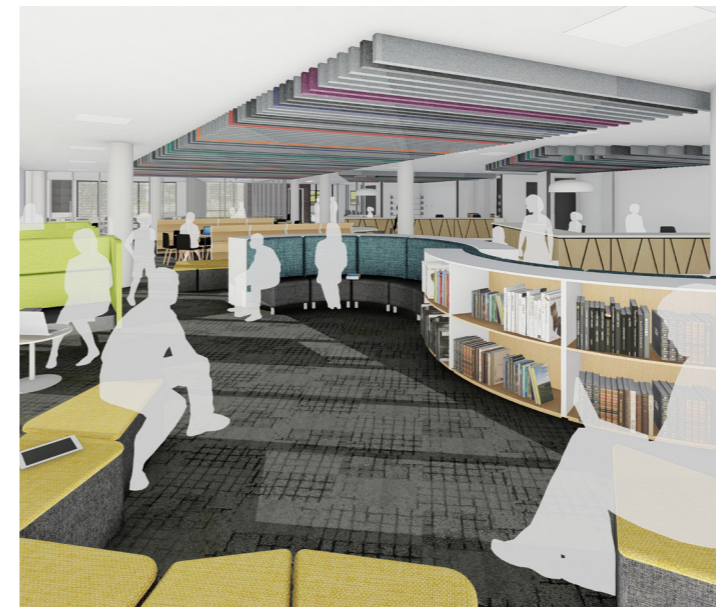
Artist impression of the library