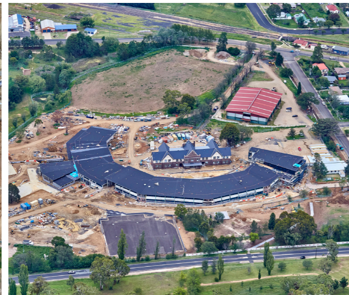
Aerial views of Armidale Secondary College redevelopment January 2020