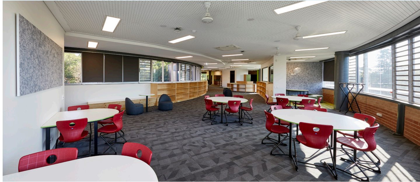
Example of facilities we are building for students across NSW