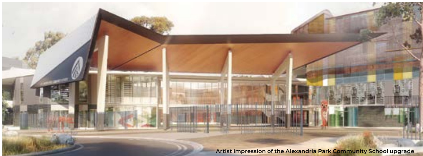
Artist impression of the Alexandria Park Community School upgrade