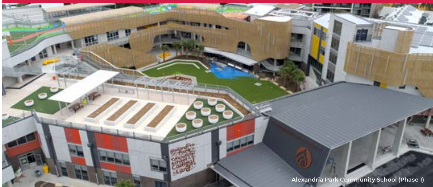
Alexandria Park Community School (Phase 1)