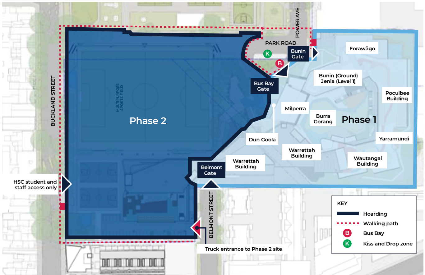
Map of the Alexandria Park Community School redevelopment