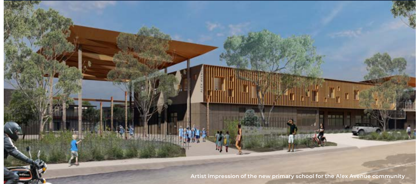
Artist impression of the new primary school for the Alex Avenue community

The NSW Government is investing $6.7 billion over four years to deliver more than 190 new and upgraded schools to support communities across NSW. In addition, a record $1.3 billion is being spent on school maintenance over five years. This is the largest investment in public education infrastructure in the history of NSW.