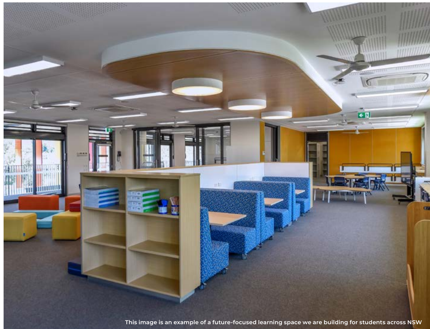
This image is an example of a future-focused learning space we are building for students across NSW

The Department of Planning, Industry and Environment granted consent on 21 May 2020. You can find out more about the State Significant Development Process at www.planning.nsw.gov.au/State-Significant-Development .