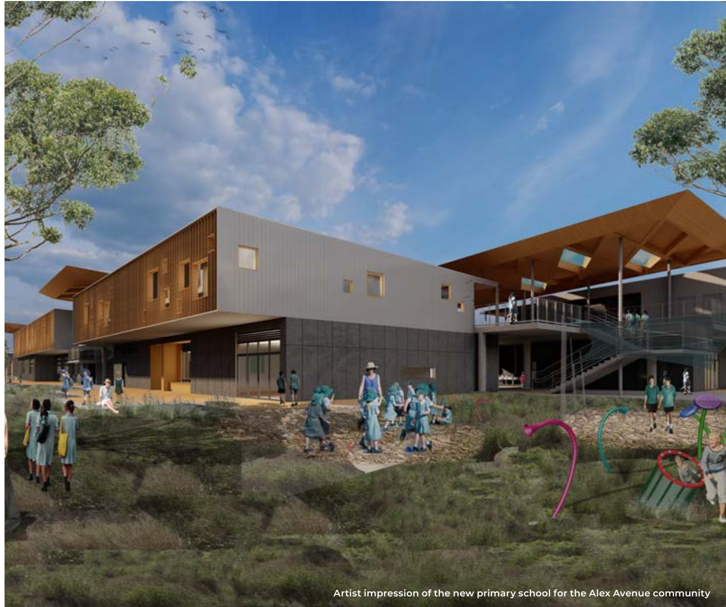
Artist impression of the new primary school for the Alex Avenue community