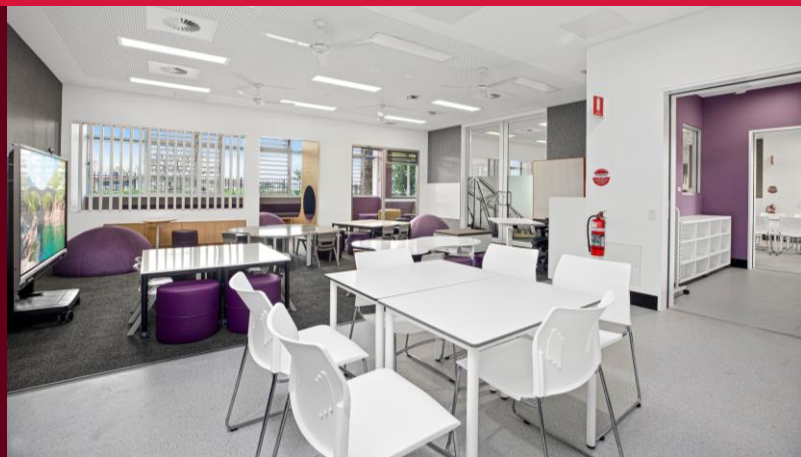
Image caption: An example of a modern classroom