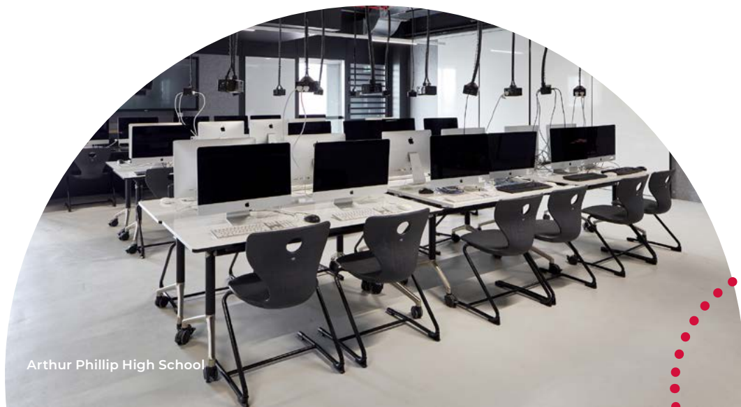
Arthur Phillip High School