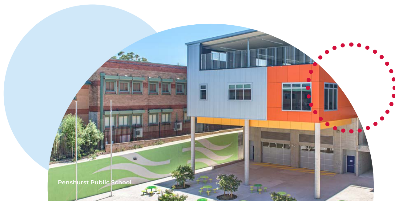
Penshurst Public School

All projects are school upgrades unless noted otherwise