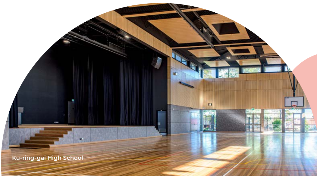
Ku-ring-gai High School

All projects are school upgrades unless noted otherwise