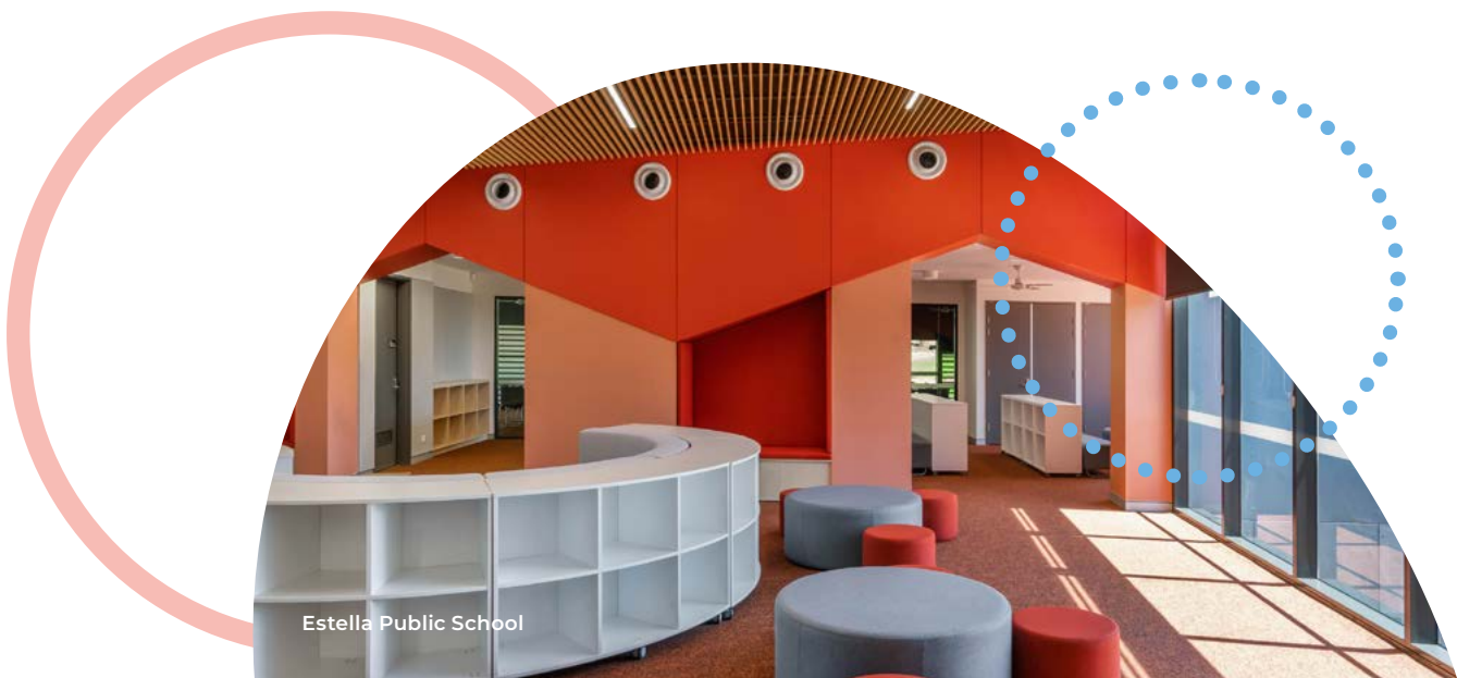
Estella Public School

All projects are school upgrades unless noted otherwise. Civil and structural engineering is likely to be procured as a single contract with a single construction-related professional service.