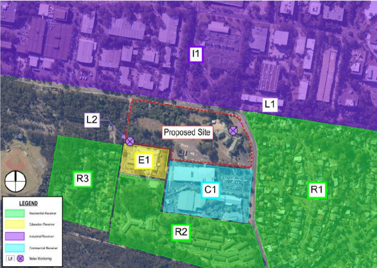
Figure 2: Overview of the site, measurement locations and surrounding sensitive receivers – from page 3 of the Construction Noise and Vibration Management Sub-Plan