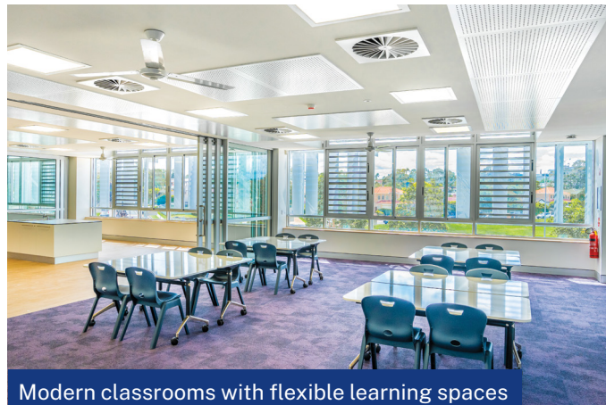
Modern classrooms with flexible learning spaces