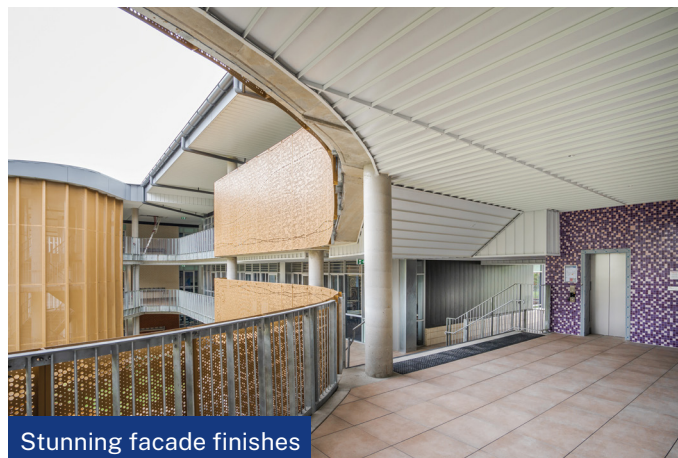
Stunning facade finishes