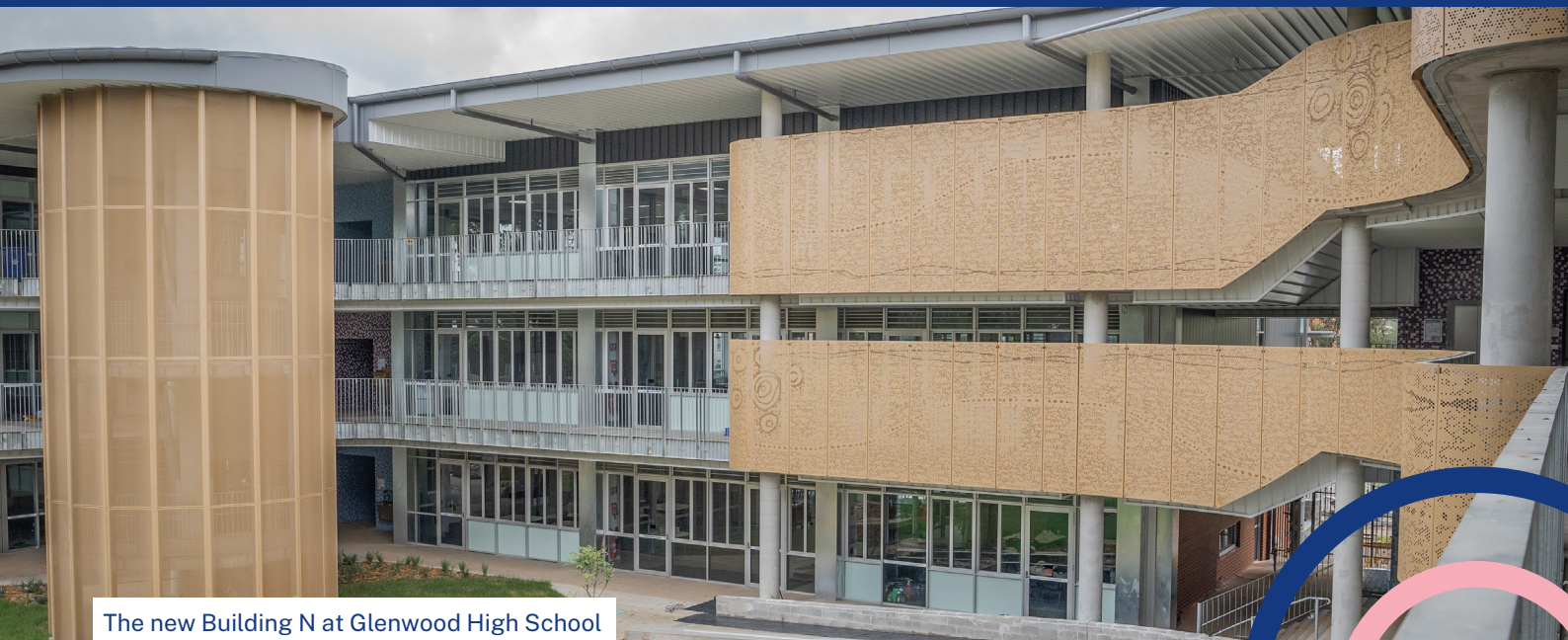
The new Building N at Glenwood High School