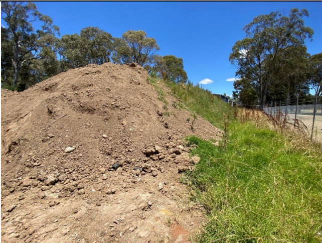
Photo 32: Topsoil stockpile located in the north-western corner of the site