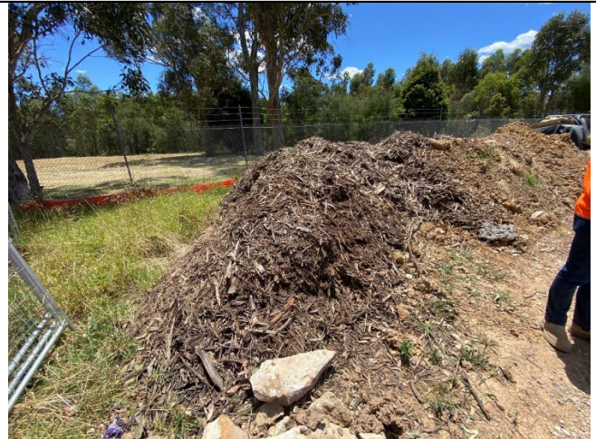
Photo 33: Mulch stockpile located adjacent to the northern boundary of the site