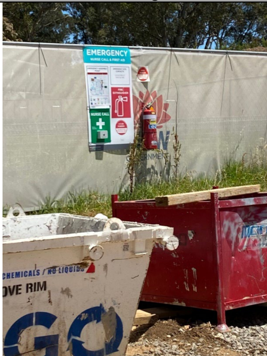
Photo 28: General construction waste bin located adjacent to western boundary of the site (empty at the time of the audit).