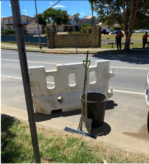
Photo 25: Road cleaning station at the site entrance on Glenwood Park Drive