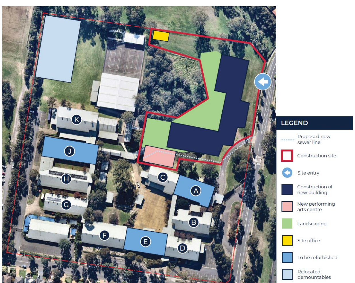
Site map of Glenwood High School project

Thank you for your patience while we deliver this important school infrastructure.